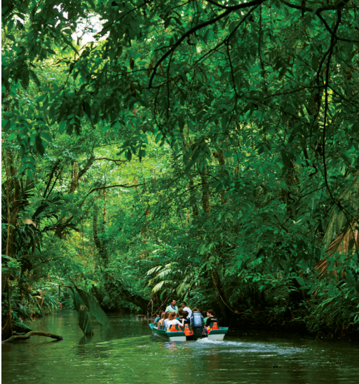
We explore Tortuguero’s canals on the pre-tour option.

Day 11: Depart for U.S. We transfer to the airport this morning for our return flights to the U.S. B