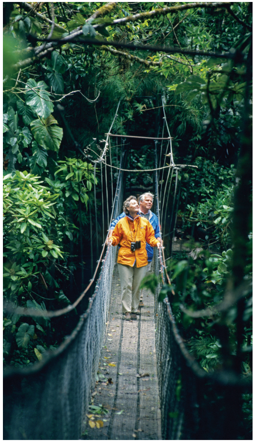
Enjoy treetop rainforest views from Arenal’s Sky Walk.