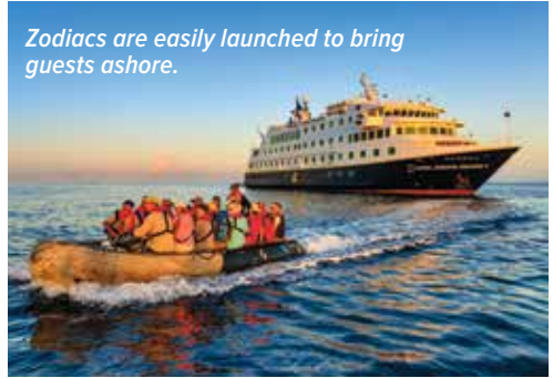
Zodiacs are easily launched to bring guests ashore.

The 96-guest National Geographic Endeavour II is newly refitted and equipped for 21st-century expedition travel. Gathering places like the expansive decks, welcoming lounge, and gracious dining room contribute to the esprit de corps that is a hallmark of your expedition. Plus cossetting cabins provide the perfect ending to active days.