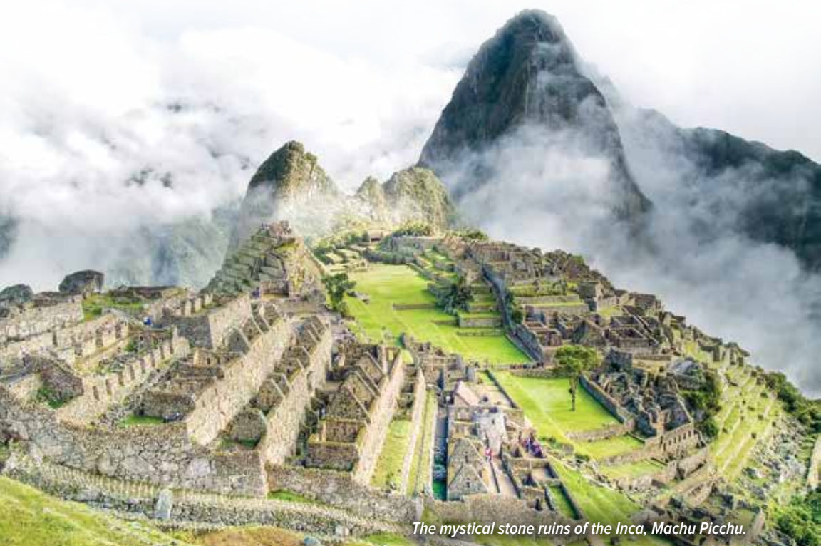
The mystical stone ruins of the Inca, Machu Picchu.

16 DAYS/15 NIGHTS—ABOARD NATIONAL GEOGRAPHIC ENDEAVOUR II