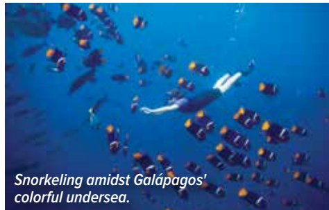
Snorkeling amidst Galápagos' colorful undersea.

To enhance your understanding of Galápagos' vibrant undersea, you'll have the opportunity to snorkel almost every day, sometimes two times a day. And snorkeling in Galápagos is fun! It means encountering sea turtles, sea lions, and penguins, too. Prefer to stay dry? You can peer beneath the surface from the comfort of a glass-bottom boat. You'll also travel with an undersea specialist assigned to capture and present vivid underwater video—to ensure that everyone can enjoy the wonders of Galápagos that lie beneath the ship.