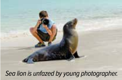
Sea lion is unfazed by young photographer.

The vast number of animals living in the Galápagos archipelago is astonishing, and a major reason you have chosen to travel to this remote part of the world. Where else on the planet can you get close to the wildlife in the context of no fear at all? This is a marvelous experience for the human