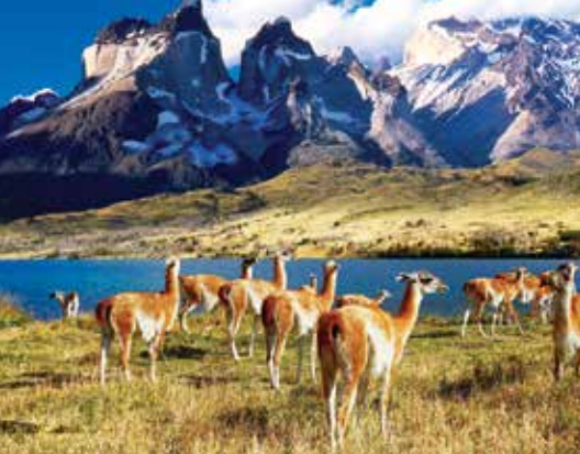
A relative of the domesticated llama, the wild guanaco is native to the Patagonian steppe.

PRSR STD U.S. Postage PAID Gohagan & Company