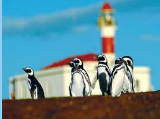
Magdalena Island in the Strait of Magellan is an important Magellanic penguin breeding site.