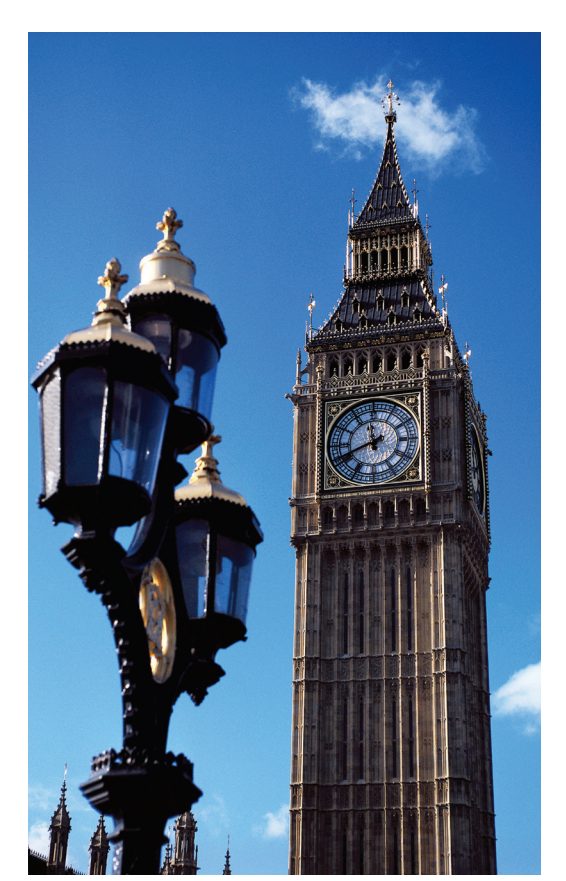
We see iconic Big Ben on Day 13.