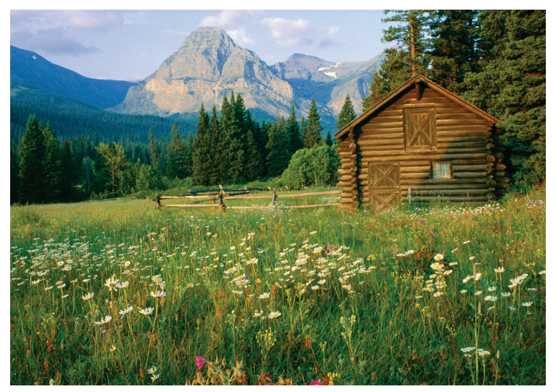
A scene in Glacier National Park, which we explore on Days 3 & 4

winding mountain pass that offers breathtaking views and hair-raising turns. After time for lunch on our own we meet up with our motorcoach and continue southwest across the Continental Divide. After arriving late this afternoon in the resort town of Whitefish, Montana, we dine together tonight. B , D