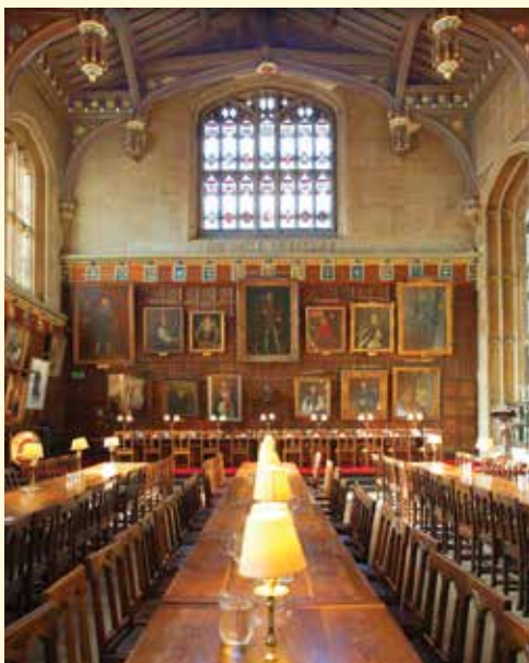
Your Farewell Dinner will be held in one of Oxford's oldest and most beautiful dining halls.

The magnificent Church of St. John the Baptist is tucked away at the bottom of Burford's main road in Oxfordshire. Inside, the monument to a gentleman of Henry VIII's Privy Chamber is said to contain England's first depictions of Amazonian Indians, inhabitants of the “New World.”