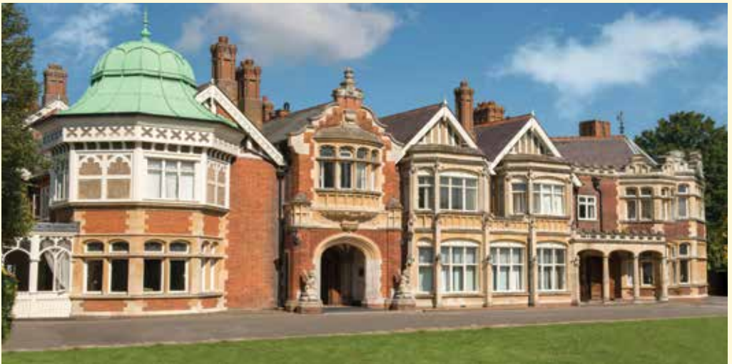
Bletchley Park is best known as the location where the German Enigma cipher was decrypted.

Affectionately named the "city of dreaming spires" by adoring poets, Oxford is home to one of England's most venerated universities, which counts Sir Thomas More, Percy Bysshe Shelley and Margaret Thatcher among its illustrious alumni. Steeped in eight centuries of history, here, the exclusive customs of a Formal Hall dinner require