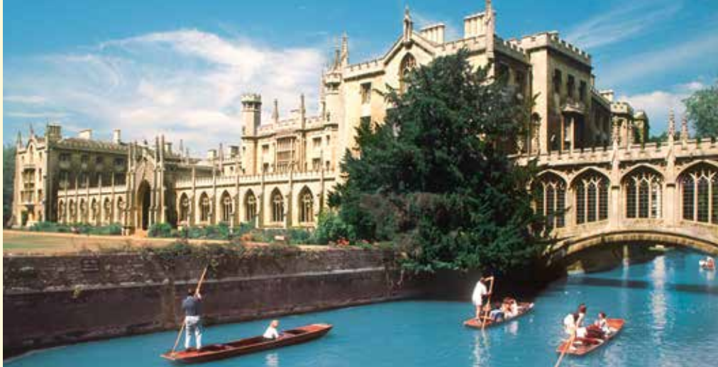
Punting along the serene River Cam through the idyllic College Backs is a treasured summer pastime in Cambridge.

proper attire and are still honored with a three-course meal and waiter service. Learn more about student life at Oxford as you walk the cobblestone squares, medieval alleyways and Renaissance quadrangles of the oldest university in the English-speaking world.