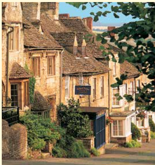
Cover: Wander amidst Oxford's honeyed, historic walls. Stroll alongside the row houses of Burford, Oxfordshire.

No funds donated to The Association of Former Students or to Texas A&M University have been used in the production or mailing of this travel brochure; all such costs are covered by our tour supplier.