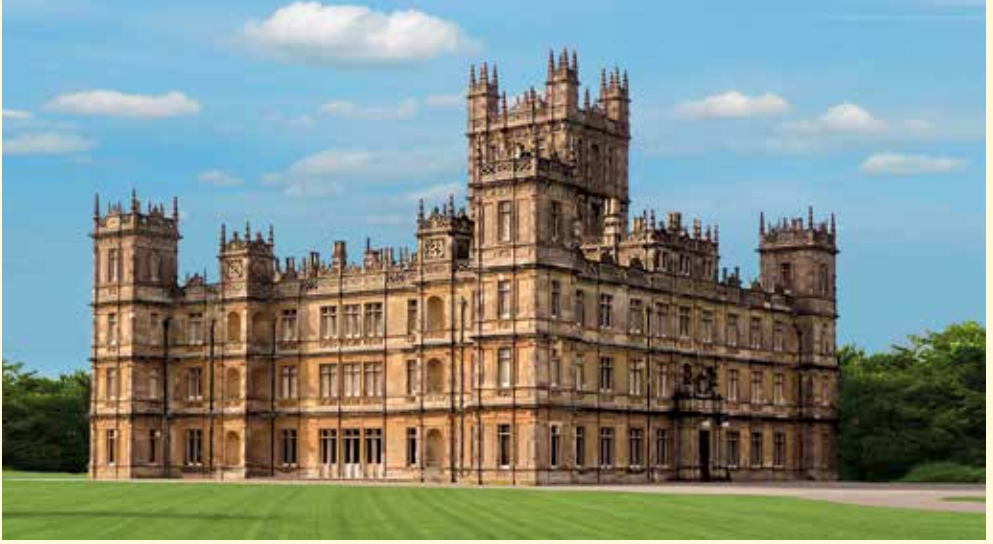
Highclere Castle, a spectacular Victorian family home, was the filming site for PBS MASTERPIECE's popular Downton Abbey television series.