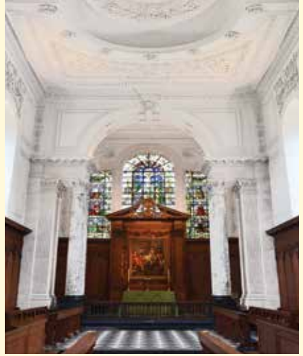
Pembroke College was the first in Cambridge to have a chapel of its own, Wren Chapel.