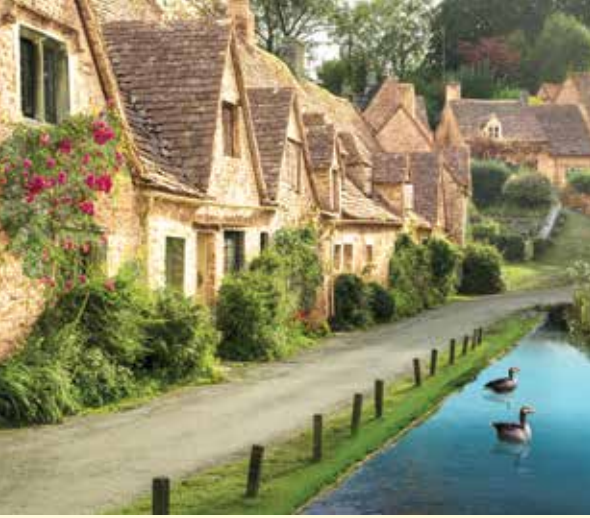
Arlington Row in Bibury is an architectural conservation area consisting of honey-colored 17 th -century stone cottages.