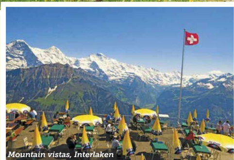
Mountain vistas, Interlaken

Tonight, enjoy a group dinner in Interlaken.