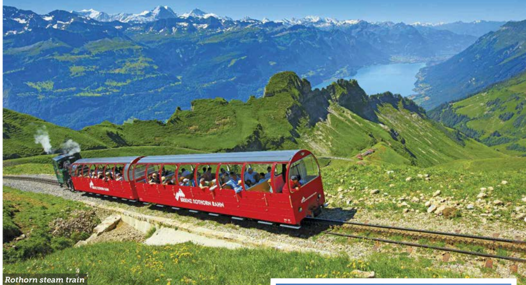
Rothorn steam train

against the majestic Wetterhorn and famous north face of Eiger. Explore Grindelwald on your own before taking a Swiss PostBus, part of Switzerland's extremely efficient rail system, through the high mountain pass Grosse Scheidegg to Rosenloui to continue the day's adventures. Stop at the Hotel Rosenloui, one of the oldest Alpine hotels, for a delicious lunch of traditional cuisine. The hotel traces its history to the 18th century, when the fledgling tourism industry emerged in the Swiss Alps. After lunch, walk through the narrow Rosenloui Glacier Gorge. Feel the cool breeze as you climb the steps that parallel the Weissenbach River, which rushes through the glacier-carved gorge.