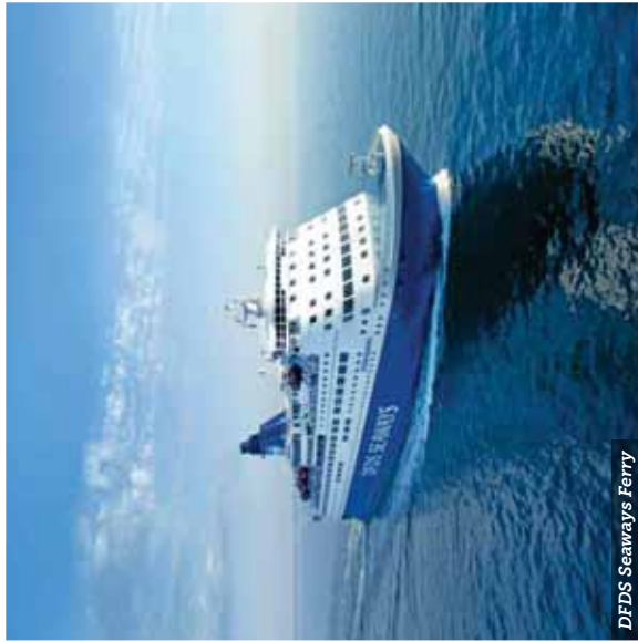
DFDS Seaways Ferry