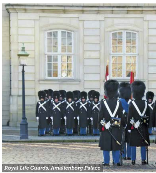
Royal Life Guards, Amalienborg Palace

Free Time: Stroll through Tivoli Gardens, and ride one of the world's oldest wooden roller coasters, or explore the Strøget pedestrian-only shopping area.