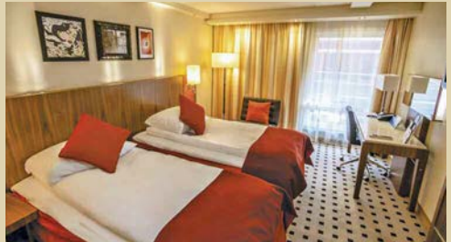
RADISSON BLU ROYAL HOTEL, BERGEN | BERGEN