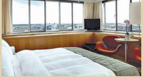
RADISSON BLU ROYAL HOTEL, COPENHAGEN | COPENHAGEN