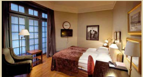
CLARION COLLECTION HOTEL BASTION | OSLO