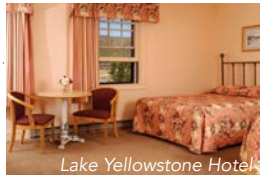
Lake Yellowstone Hotel

Confirmed by the National Park Service, you'll stay at one of the following Yellowstone facilities: Lake Yellowstone Hotel, Old Faithful Inn, Old Faithful Snow Lodge, Mammoth Hot Springs Hotel (all pictured to right), or Canyon Lodge & Cabins, Grant Village, or Lake Lodge Cabins. Each offers comfortable lodging and modern amenities.