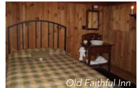
Old Faithful Inn