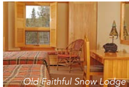
Old Faithful Snow Lodge