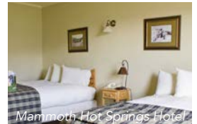
Mammoth Hot Springs Hotel