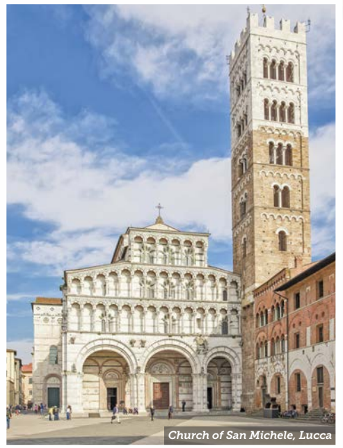
Church of San Michele, Lucca

Discovery: Lucca. Venture into nearby Tuscany to the walled city of Lucca. Visit the grand Romanesque Duomo di San Martino . Admire the white marble, art-filled chapels of