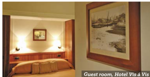
Guest room, Hotel Vis à Vis