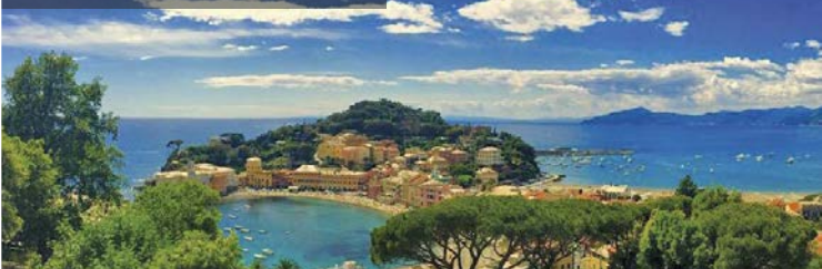
View of Sestri Levante from Hotel Vis à Vis