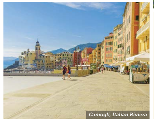
Camogli, Italian Riviera

Enrichment: Flavors of the Cinque Terre. Learn about the Cinque Terre through a lesson in its unusual geography before enjoying a tasting of regional wine and foods.