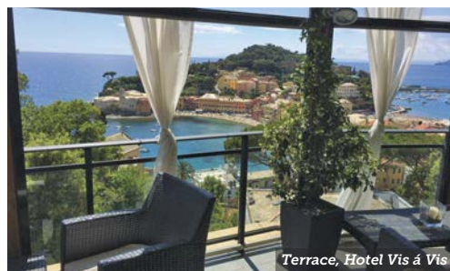
Terrace, Hotel Vis à Vis

🕒 Elective experiences available at an additional cost