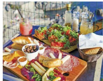
Above: Manarola, Cinque Terre | Cover photo: Vernazza, Cinque Terre