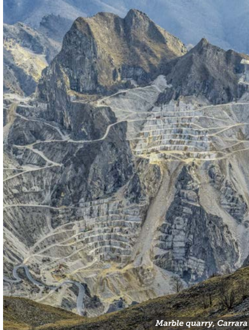
Marble quarry, Carrara