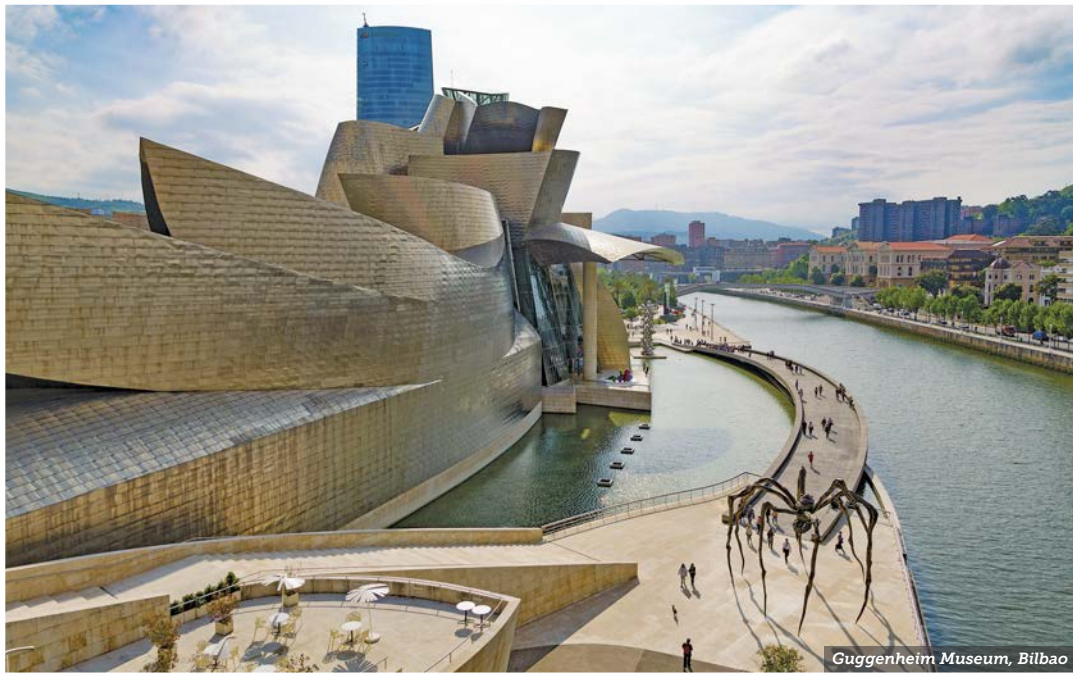
Guggenheim Museum, Bilbao