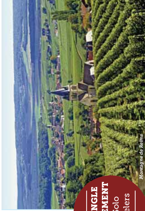
Montagne de Reims