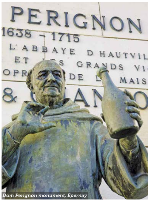
Dom Perignon monument, Épernay