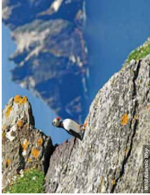
Wild Atlantic Way