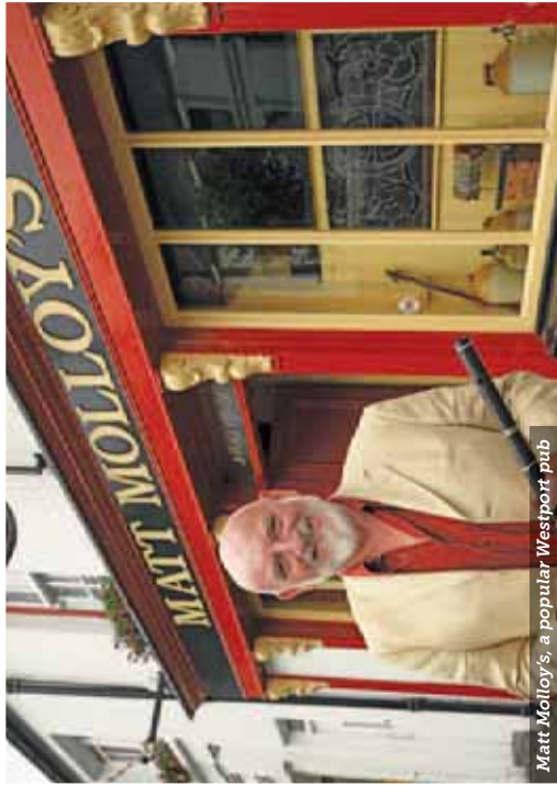
Matt Molloy's, a popular Westport pub