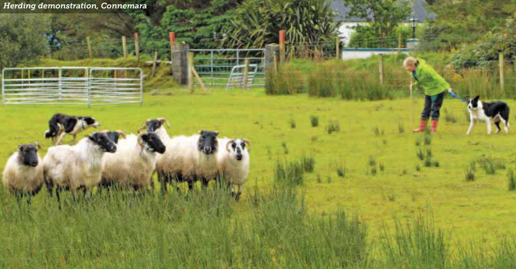
Herding demonstration, Connemara