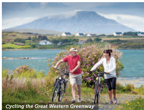
Cycling the Great Western Greenway

starkly beautiful landscape shaped by ancient glaciers that Oscar Wilde described as "savage." See Croagh Patrick Mountain, where St. Patrick is said to have fasted for 40 days in the fifth century. Visit the family-owned Glen Keen farm for a sheepdog demonstration and chat about sheep farming with a member of the family. Continue to Kylemore Abbey, a romantic, 19th-century castle overlooking a beautiful lake, where you will tour the home and gardens. Originally built by a wealthy Londoner for his beloved wife, the castle was later purchased by Benedictine nuns in 1920. Conclude your day with a trip to the delightful town of Clifden and return via scenic Inagh Valley.