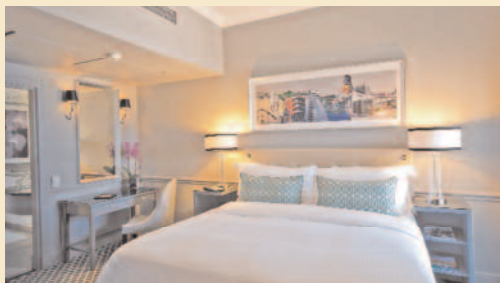
54 ON BATH JOHANNESBURG