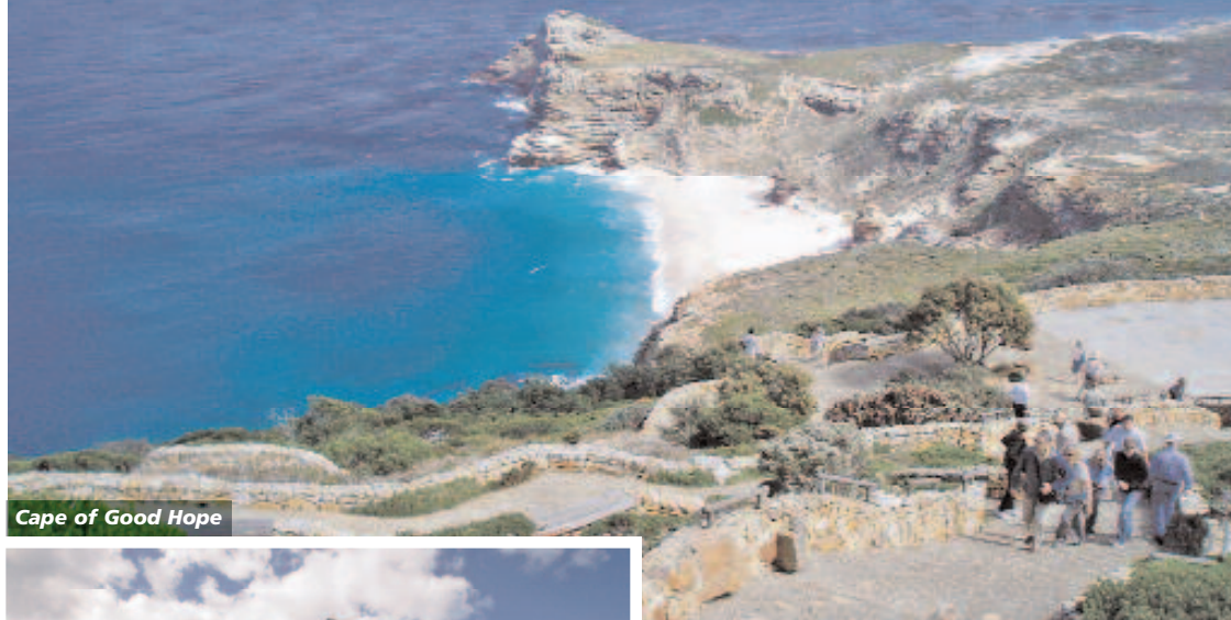
Cape of Good Hope