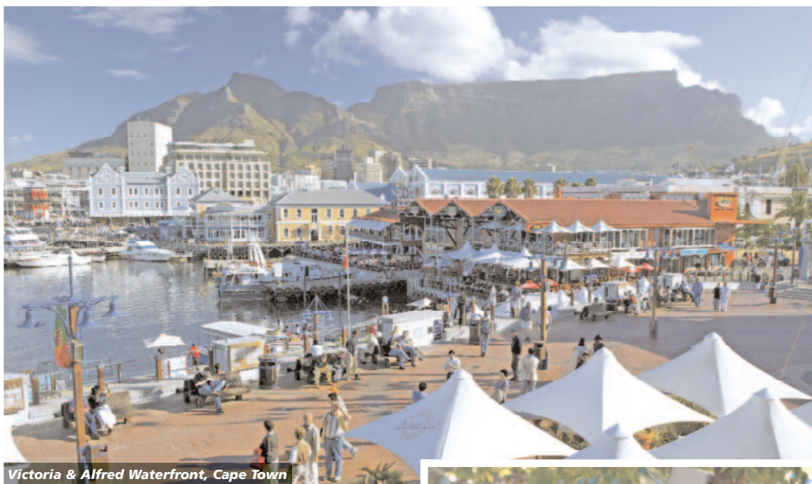
Victoria & Alfred Waterfront, Cape Town

Discover the rich natural and cultural heritage of southern Africa. Cape Town is a showcase of Cape Dutch houses and inspiring landmarks, including Robben Island and St. George's Cathedral. Across the country, Soweto, once the main battleground in the war on apartheid, now offers opportunity and hope for a better future. No trip to southern Africa would be complete without a safari in its greatest parks and game reserves. Experience the thrill of up-close encounters with lions lazing in the grass after a kill or elephants quenching their thirst by a watering hole, and feel the power of thundering Victoria Falls.