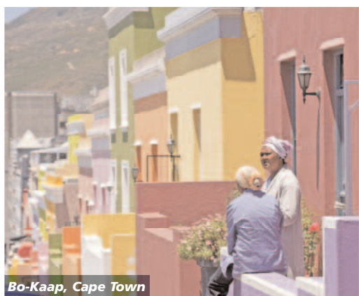
Bo-Kaap, Cape Town