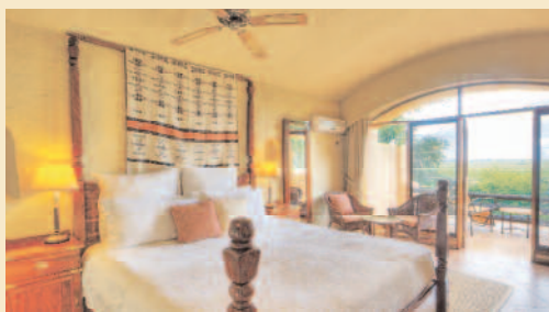
CHOBE GAME LODGE CHOBE NATIONAL PARK