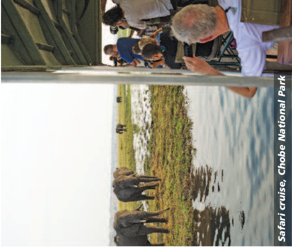
Safari cruise, Chobe National Park