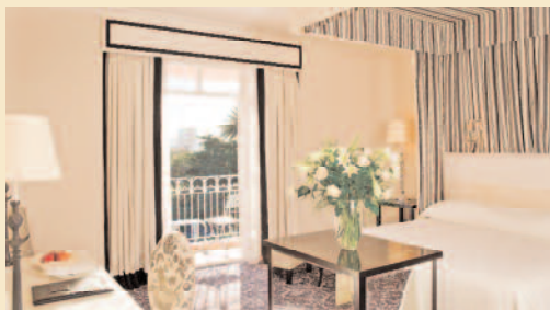
BELMOND MOUNT NELSON HOTEL CAPE TOWN