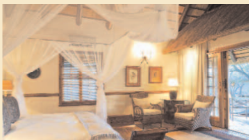
WATERSIDE LODGE THORNYBUSH GAME RESERVE