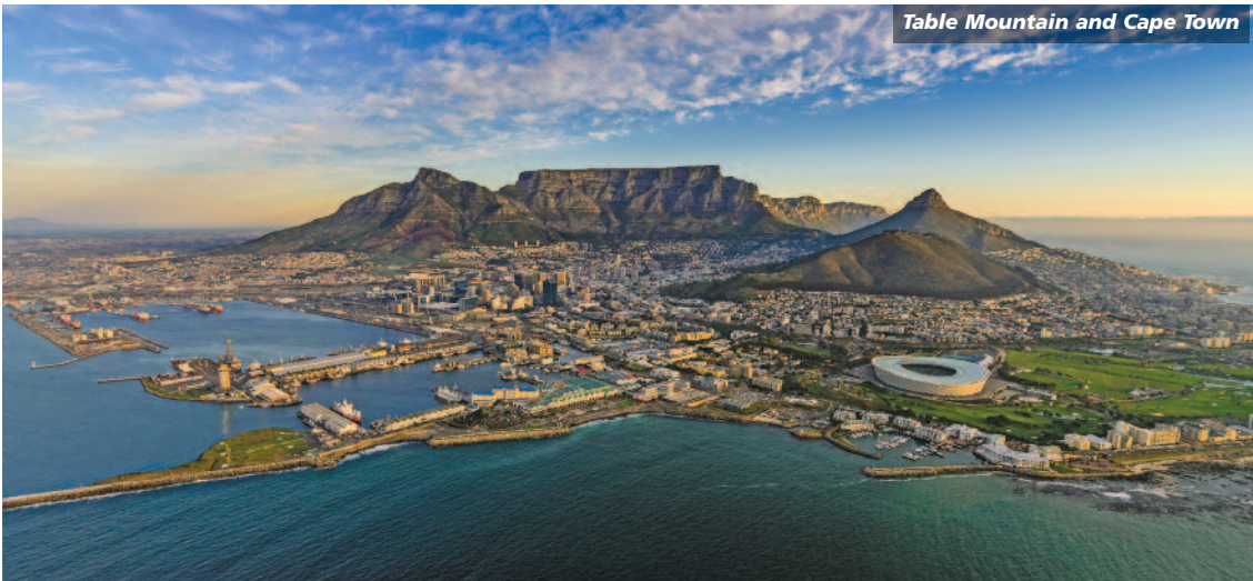
Table Mountain and Cape Town