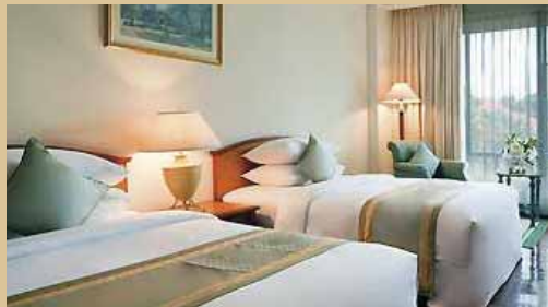
SOFITEL ANGKOR PHOKEETHRA GOLF AND SPA RESORT | SIEM REAP