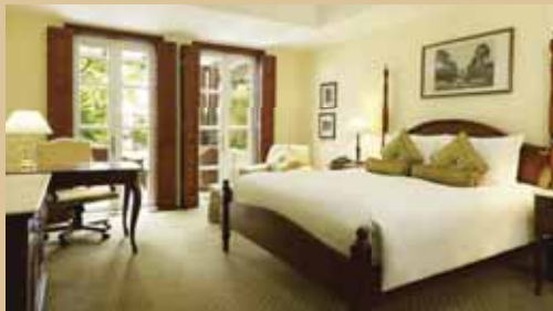
PARK HYATT SAIGON SAIGON