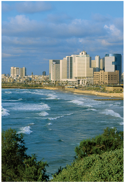
Sophisticated seaside Tel Aviv