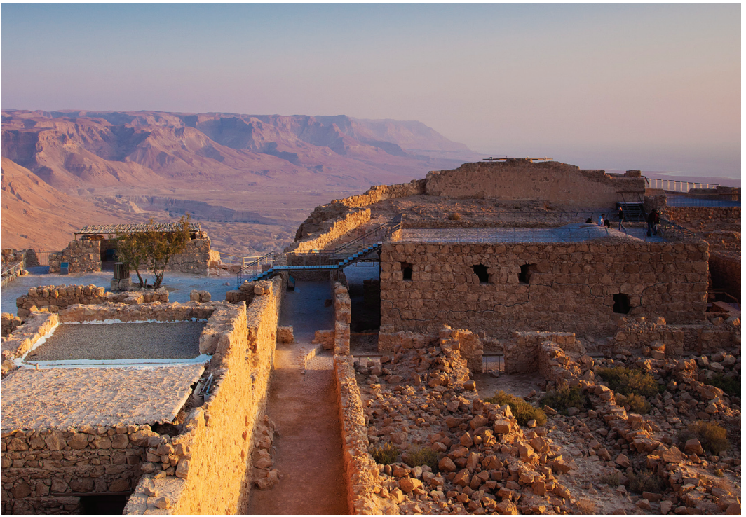
We explore the ruins at legendary Masada on Day 11.

visitors, settlers, and invaders for more than two millennia. B,D