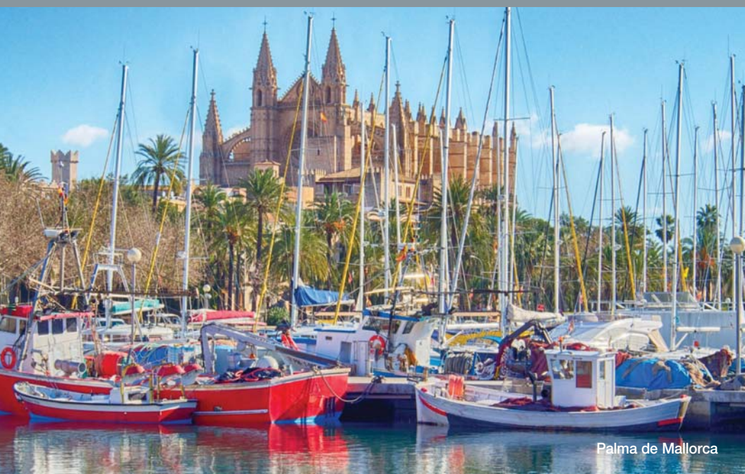
Palma de Mallorca