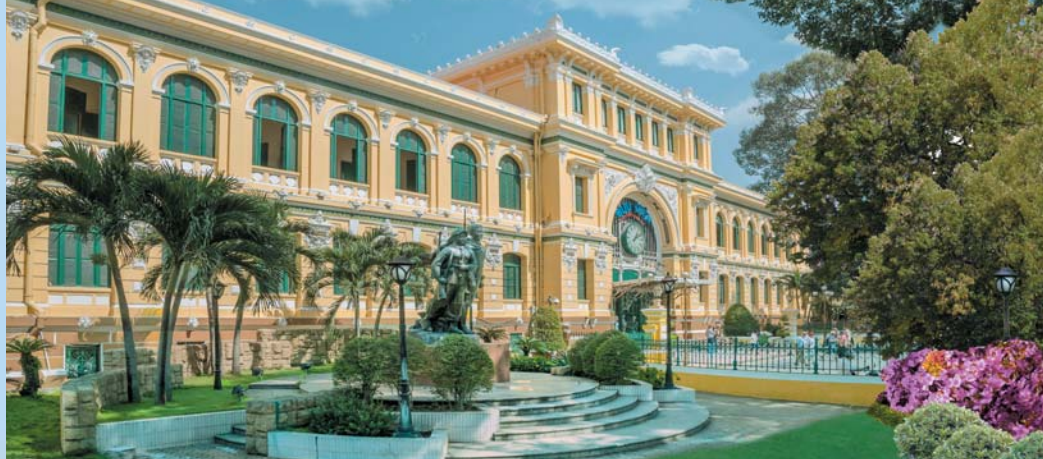
Designed by famed French architect Alexandre-Gustave Eiffel, Saigon's beautifully preserved, neoclassical Central Post Office was opened in 1891 and today remains Vietnam's busiest post office.

The pagoda's seven-tiered, octagonal Phuoc Duyen tower is the highest stupa in Vietnam.