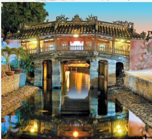
The iconic Lai Vien Kieu (Lady of the Pagoda) Bridge was built to link Hoi An's Chinese and Japanese quarters.

Saigon has remained a vibrant convergence of French romance and Vietnamese flair, where women still wear the traditional national costume of áo dài dresses, a silk tunic worn over pantaloons. Visit the imposing Reunification Hall, which once served as the South Vietnamese Presidential Palace; the lovely 19 th -century, European-style Central Post Office; and the War Remnants Museum, which offers a unique perspective on the Vietnam War through the eyes of the Vietnamese. See the neo-Romanesque-style Notre Dame Cathedral and the opulent Saigon Opera House, both a distinct reminder of the city's French Colonial history. Then, visit the Ben Thanh Market, one of the oldest surviving structures in Saigon, where merchants offer exotic spices, aromatic cuisine, traditional Chinese medicines and alluring handcrafted wares and textiles.