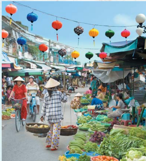
Experience the colorful atmosphere of an outdoor market, a quintessential aspect of daily life in Saigon.

Stroll the city's colorful riverside market and observe locals engaging in the art of bartering. Then, visit the impressive Museum of Cham Sculpture in Da Nang, exhibiting the world's largest collection of Cham sandstone works of art. Stop at the foot of the landmark Marble Mountain, where skilled carvers chisel marble jewelry and sculptures.