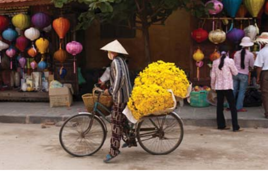
A customary means of transportation for generations, the bicycle is a ubiquitous sight in Vietnam.