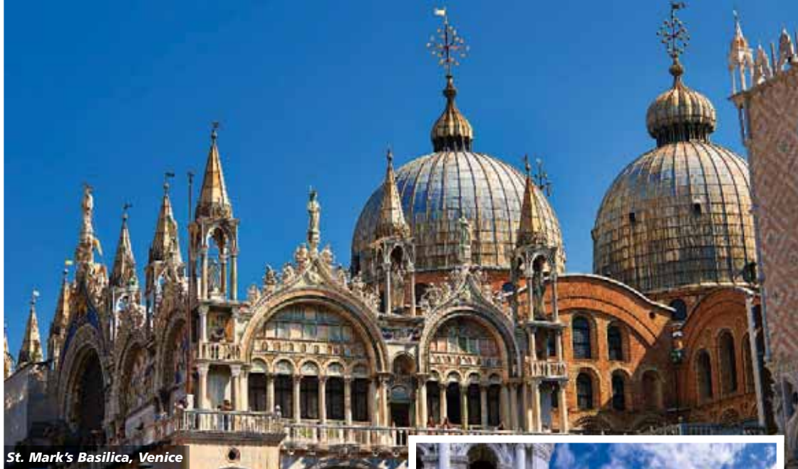
St. Mark's Basilica, Venice