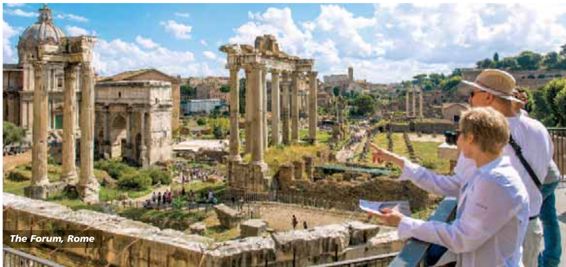
The Forum, Rome