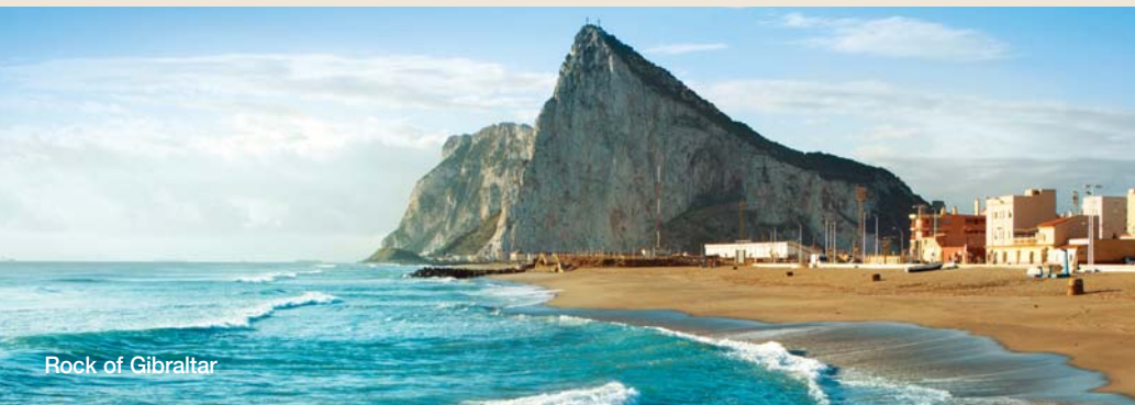
Rock of Gibraltar

FOR MORE INFORMATION, VISIT AGGIENETWORK.COM/TRAVEL