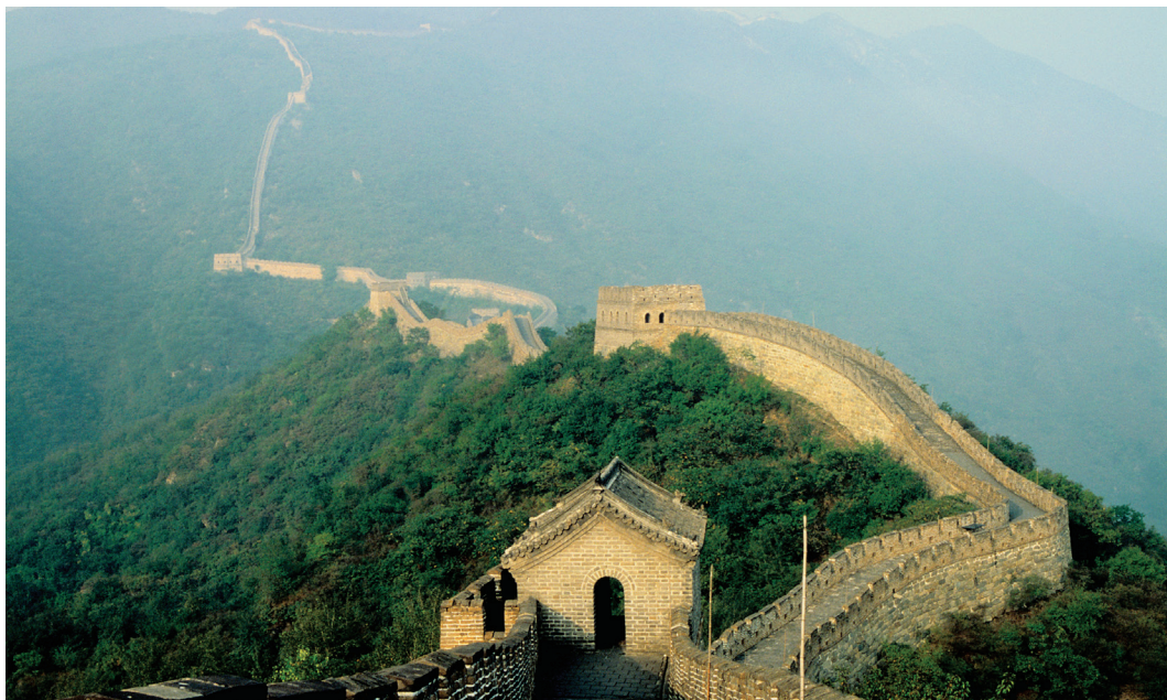
China's Great Wall winds across deserts and grasslands, mountains and plateaus for more than 5,500 miles.

Day 8: Xian This morning we tour the Shanxi Provincial Museum, with an acclaimed collection of historic and cultural artifacts. We eat lunch in a local restaurant then visit a typical farming village where we meet the local people and see their life-style up close. B,L