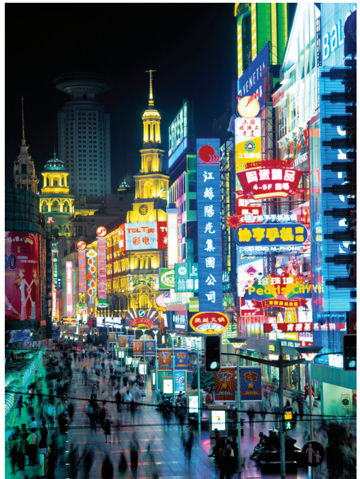
Nanjing Road, Shanghai's premier shopping street

Day 19: Depart for U.S. We depart Shanghai for our return flight to the U.S. B