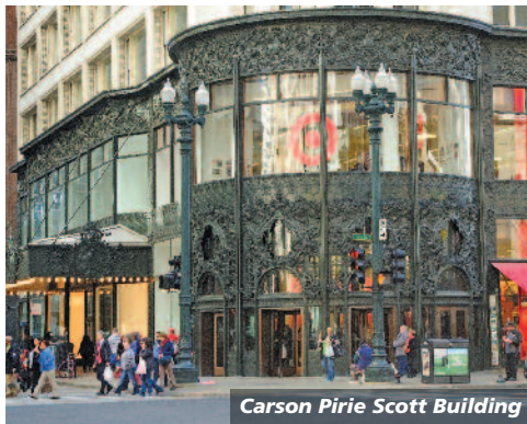
Carson Pirie Scott Building

Excursion: Chicago River Architecture Cruise. Marvel at the city's skyscrapers from a different vantage point onboard a cruise along the Chicago River. Discover fascinating details about the city's famous landmarks and the latest additions gracing the skyline.