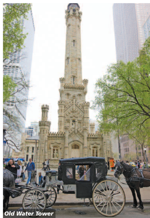
Old Water Tower

commissioned work, is considered one of the most innovative buildings of the 20th century. Tour this recently restored Unitarian church made of cast concrete before strolling along Forest Avenue to admire the largest grouping of Prairie School homes anywhere.