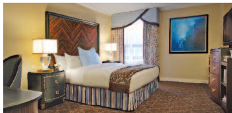
Palmer House Hilton