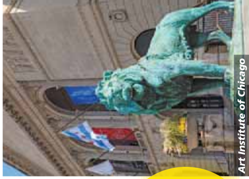
Art Institute of Chicago