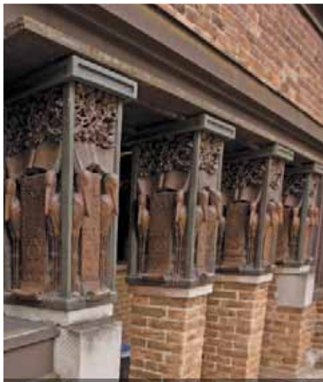
Detail, Frank Lloyd Wright studio, Oak Park

All prices listed are in USD. Special offers, promotions and discounts cannot be combined. CST Registration No. 2028271-20. Fla. Seller of Travel Reg. No. ST-33300. Iowa Seller of Travel No. 520. Ohio Seller of Travel Reg. No. 8889139. Washington State Seller of Travel Reg. No. 601-820-781. PARTICIPATING AIRLINES-all IATA and ARC Member Carriers ©2017 AHI Travel Printed in the USA.