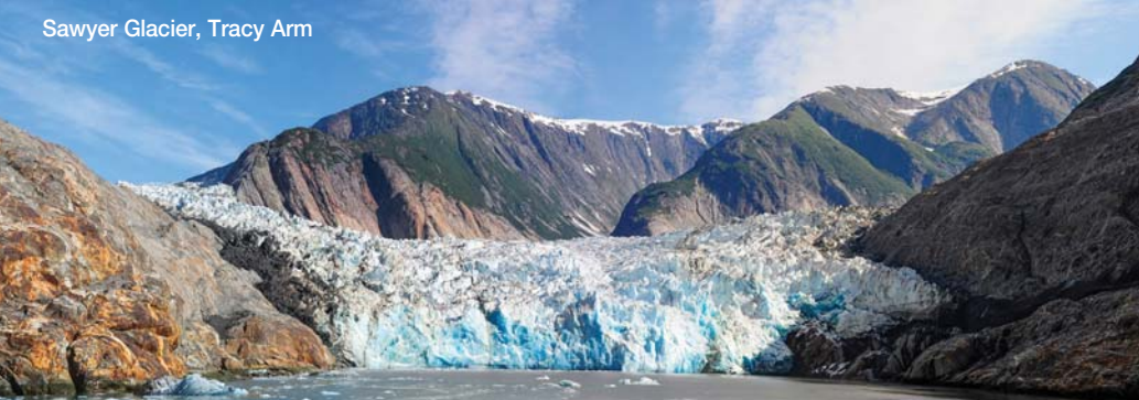
Sawyer Glacier, Tracy Arm

Oceania Cruises may modify the cruise itinerary up to and during the voyage. Air arrangements, cruise accommodations, local transportation, and optional shore excursions are arranged by Oceania Cruises, which may use other suppliers or providers to render the services. The agreement in this brochure is the exclusive and entire statement of the agreement between you and Go Next, Inc. It should be read carefully.