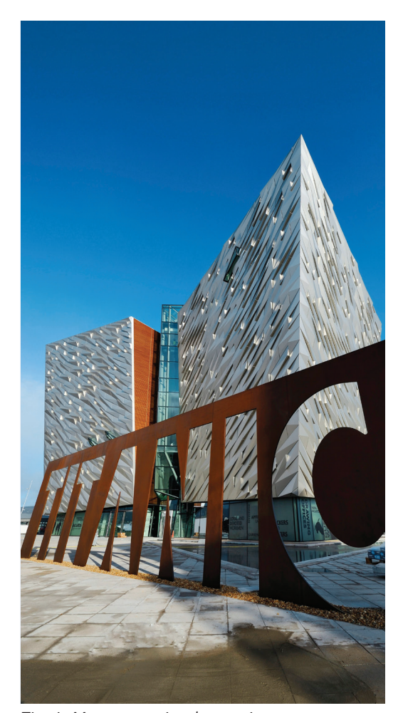
Titanic Museum, optional extension