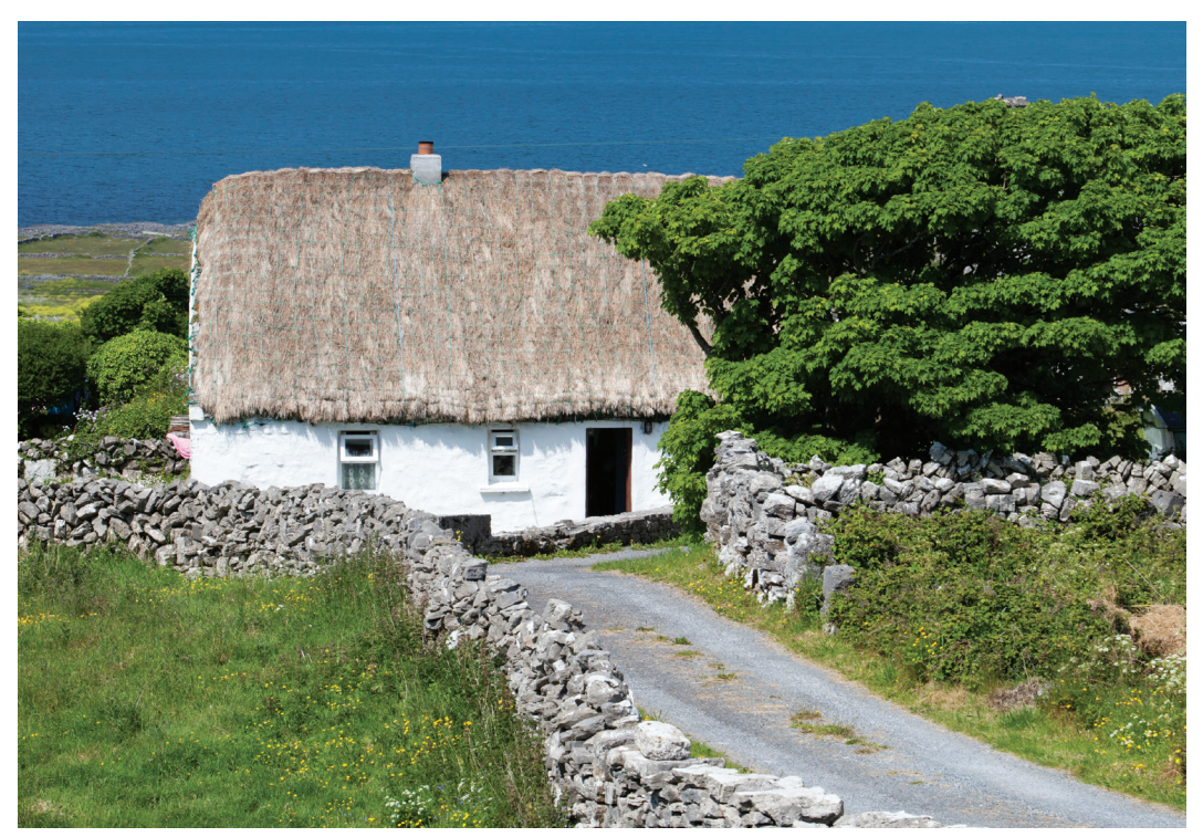
Aran Island scene

history has been an inspiration to artists, writers, and filmmakers. Sitting across Galway Bay in the midst of the Atlantic, the islands feature primitive stone forests, early Christian churches, and medieval castles – as well as shops, galleries, and restaurants. An islander guides our tour here, imparting local lore along the way. We stop at Dun Aenghus Fortress, the three prehistoric stone walls crowning the tallest cliffs of Inismor; have lunch in a local pub; and enjoy some free time before returning to the mainland and our hotel late this afternoon. Dinner tonight is at a local restaurant in the village of Bearna. B , L , D