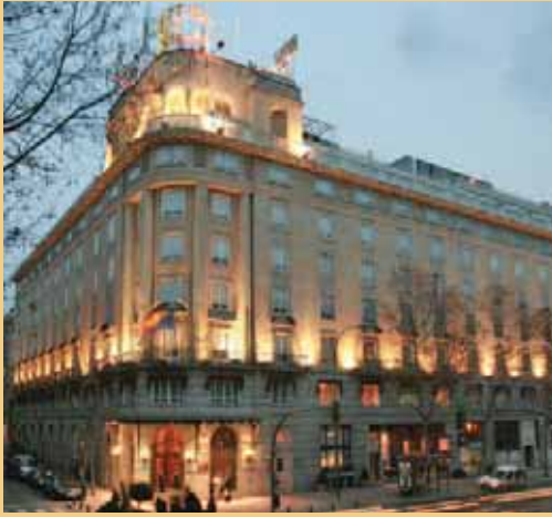
HOTEL WELLINGTON | MADRID