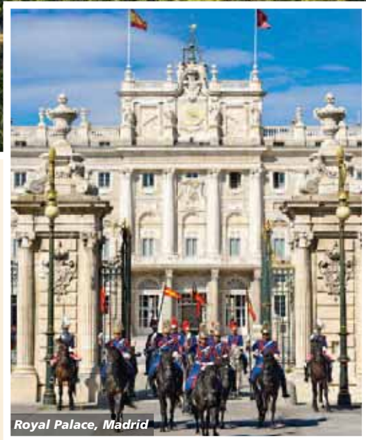
Royal Palace, Madrid

imposing Toledo Cathedral, one of the most impressive Gothic structures in the world. Stand before El Greco’s “The Burial of the Count of Orgaz,” inside Santo Tomé Church, and step inside the Santa María La Blanca Synagogue.