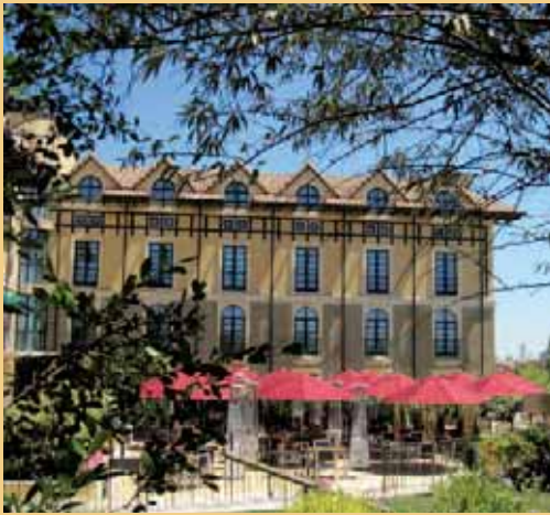
HOTEL VILLA DE LAGUARDIA SERCOTEL | LAGUARDIA