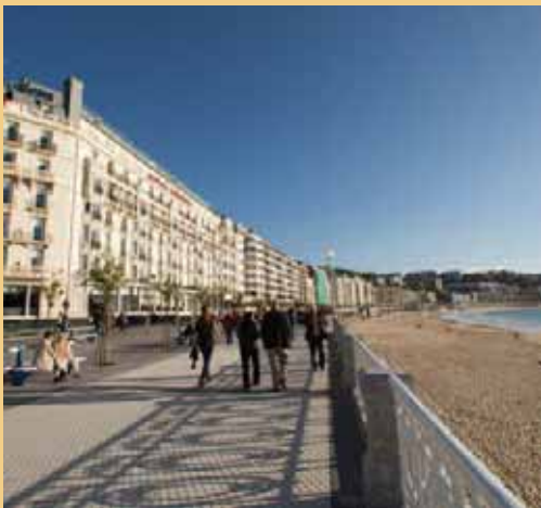
HOTEL DE LONDRES Y DE INGLATERRA | SAN SEBASTIÁN