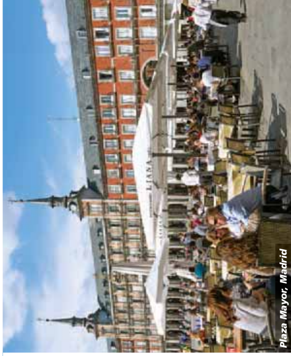
Plaza Mayor, Madrid