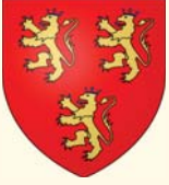
Dordogne Coat of Arms

Experience firsthand the true character and traditions of Dordogne during this comprehensive, small group travel program. It features the beautiful départements and countryside of southwestern France, the medieval village of Sarlat-la-Canéda within the oak-forested Périgord Noir and the world's largest collection of magnificent prehistoric art. Enjoy an enriching travel experience like no other; become immersed in the rhythm of daily life in Dordogne by interacting with local people; explore the history, culture, art, language and cuisine—and unpack just once! This comprehensive program is one of the popular VILLAGE LIFE® series, an intimate travel experience at just the right pace.