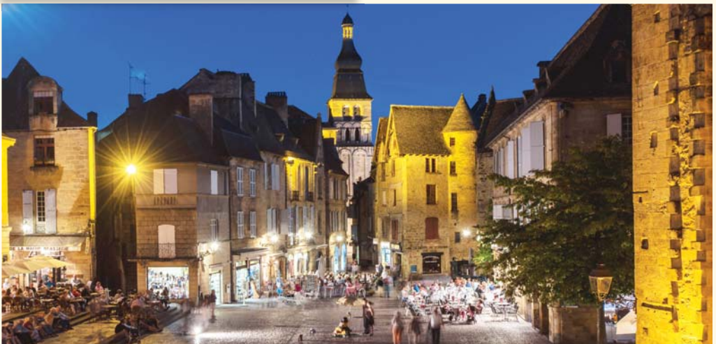
Savor the delights of traditional French cuisine in the village of Sarlat, where regional specialties are prepared from the freshest ingredients from the Sarlat Market, one of the best in France.

CULTURAL ENRICHMENT: Attend the private, specially arranged presentation by a local expert on preserving the medieval architecture of Sarlat.