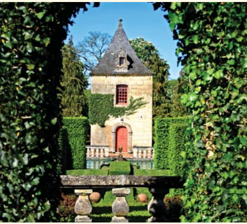
Admire the finest "English" gardens in France as you stroll through the enchanting grounds of Eyrignac Manor.