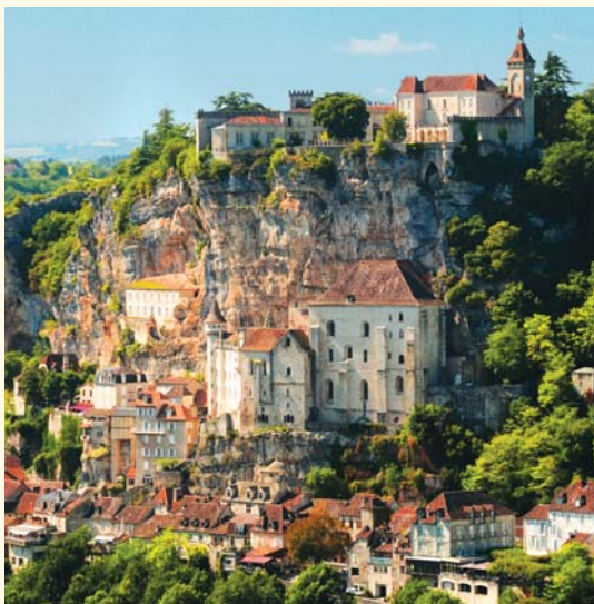
Rocamadour has beckoned travelers and pilgrims alike to its summit above a tributary of the Dordogne River.

Carved beneath a cliff overlooking the picturesque Vézère River, the prehistoric troglodyte village and UNESCO World Heritage site of La Madeleine offers unique insight into the Magdalenian culture, which prevailed in southern Europe for over 60 centuries from 15,000 to 9000 B.C. This ancient settlement of approximately 20 dwellings once accommodated 100 residents at a time.