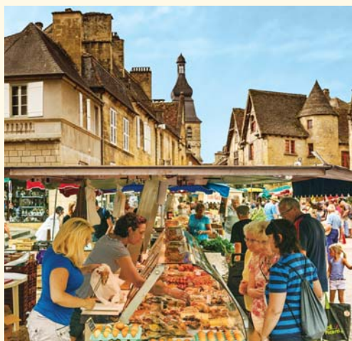
Experience Sarlat-la-Canéda's twice-weekly market, a medieval tradition in the heart of the village.

CULTURAL ENRICHMENT: Guided excursion to see L'Abri du Cap-Blanc's prehistoric cave friezes.