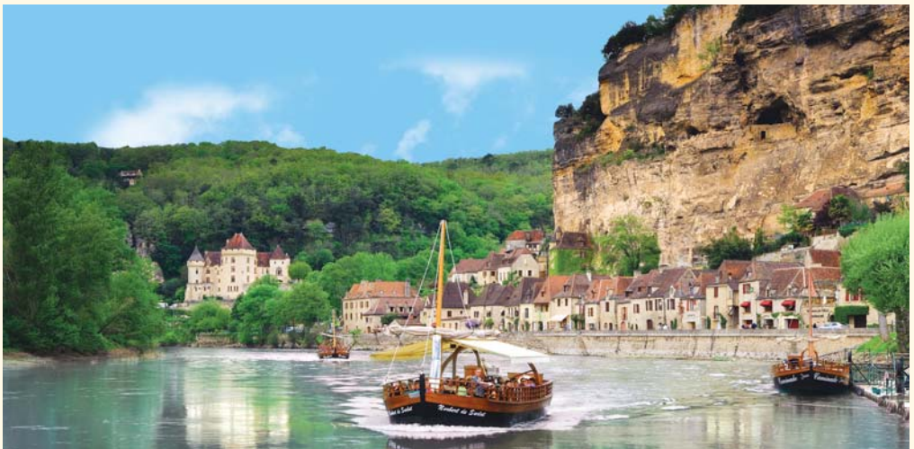
Sail the bucolic Dordogne River aboard a traditional 19 th -century wooden gabare, the typical mode of transportation of the Périgord region for more than 150 years.