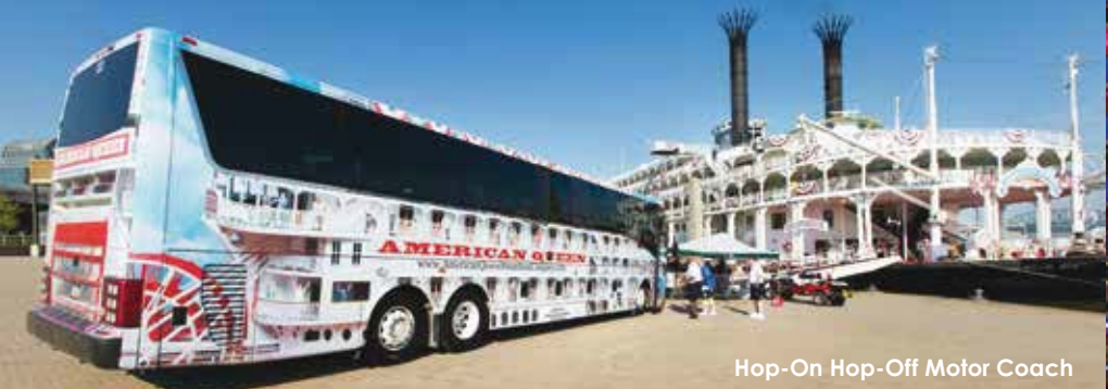
Hop-On Hop-Off Motor Coach