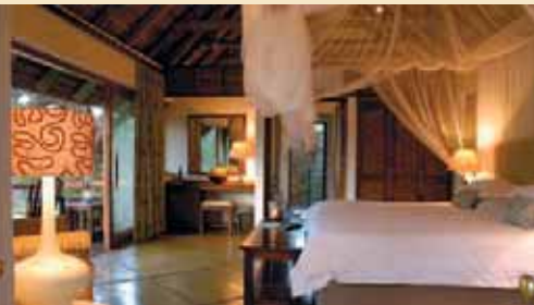
THORNYBUSH GAME LODGE THORNYBUSH GAME RESERVE