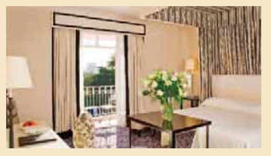
BELMOND MOUNT NELSON HOTEL CAPE TOWN