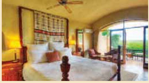
CHOBE GAME LODGE CHOBE NATIONAL PARK