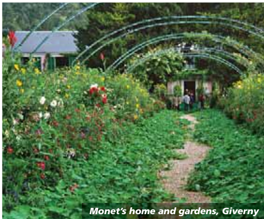
Monet's home and gardens, Giverny

which features a mix of Romanesque and Gothic architecture.