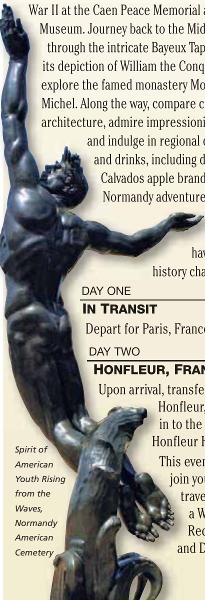
Spirit of American Youth Rising from the Waves, Normandy American Cemetery

Excursion: Le Mont Saint-Michel. With one glimpse of Mont Saint-Michel's silhouette rising above the flat, white sands that surround the granite outcrop where the sanctuary church sits, you'll know why this UNESCO World Heritage