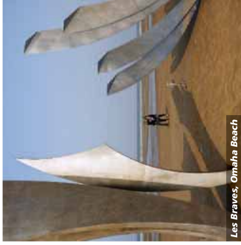
Les Braves, Omaha Beach