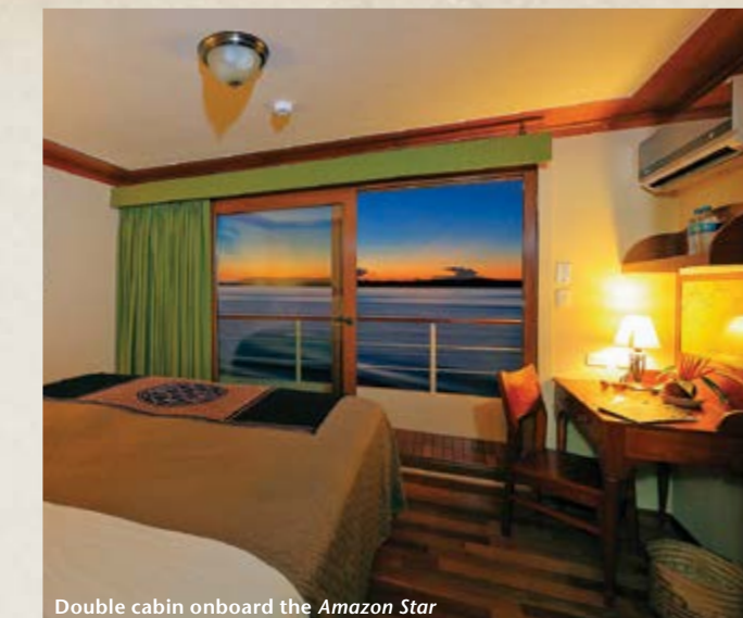
Double cabin onboard the Amazon Star

Day 6 • Wednesday RÍO PACAYA / PACAYA-SAMIRIA RESERVE Once reaching the depths of the reserve we hike through the igapó (seasonally flooded forest). Periodically throughout the year, guests may even release turtle hatchlings. On an afternoon excursion we search for scarlet macaws, hoatzins, black-collared hawks and red howler monkeys. (B,L,D)