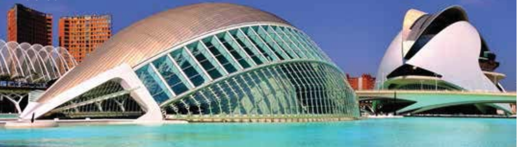
City of Arts and Sciences Valencia

Oceania Cruises may modify the cruise itinerary up to and during the voyage. Air arrangements, cruise accommodations, local transportation, and optional shore excursions are arranged by Oceania Cruises, which may use other suppliers or providers to render the services. The agreement in this brochure is the exclusive and entire statement of the agreement between you and Go Next, Inc. It should be read carefully.