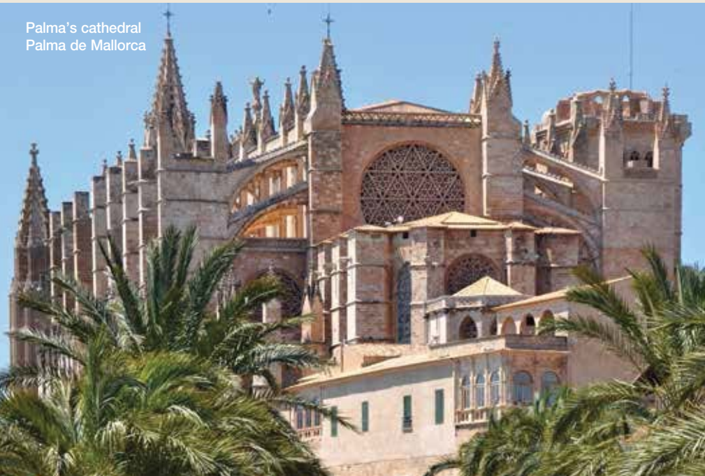
Palma's cathedral Palma de Mallorca