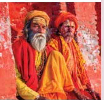
Top: Elephants At The Amber Fort Bottom: Holy Men

JOIN US ON A COMPREHENSIVE 15-DAY JOURNEY THROUGH THE SPLENDORS OF WEST BENGAL: CRUISING THE LOWER GANGES. Brimming with political intrigue, religious significance, natural wonders, and economic potential, India has captured the imagination of world travelers and fueled the desires of conquering rulers from Alexander the Great to Queen Victoria. Along the nation's eastern border, in the state of West Bengal, the Ganges River is revered as a life-giving force and sacred to those who practice the Hindu faith.