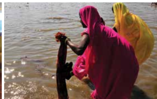
(L to R): Ganges Voyager; Taj Mahal; Dining Room; Viceroy Suite; Outdoor Lounge; Amber Fort, Jaipur