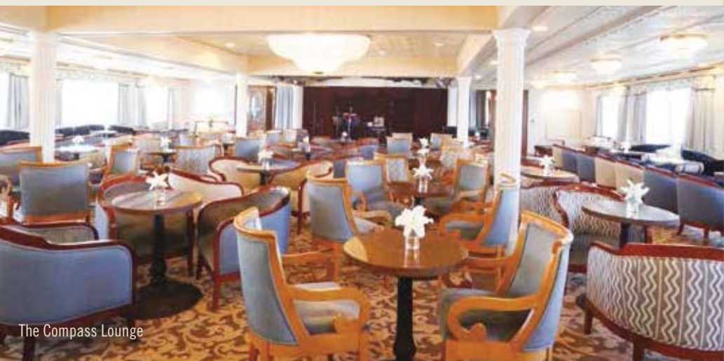
The Compass Lounge

Haimark Line, Ltd. may modify the cruise itinerary up to and during the voyage. All cruise accommodations and shore excursions are arranged by Haimark Line, Ltd., which may use other suppliers or providers to render services. The agreement in this brochure is the exclusive and entire statement of the agreement between you and Go Next, Inc. It should be read carefully.