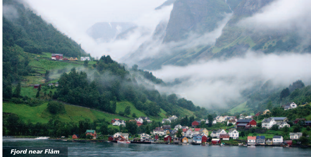
Fjord near Flåm