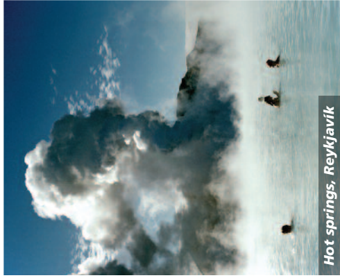
Hot springs, Reykjavik