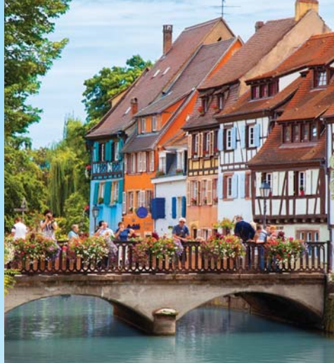
Half-timbered houses in Strasbourg's Petite-France quarter reflect the city's dual French and German character.

Heidelberg epitomized Germany, nestled in the densely wooded valley of the Neckar River and alive with the spirit of German Romanticism. On the walking tour, see how Heidelberg has preserved its authentic Renaissance-Baroque character, including the eight remaining arches of the famous Alte Brücke (Old Bridge) that span the Neckar River. Visit imposing Heidelberg Castle, a magnificent, 13 th -century edifice perched above the river. The stately ruins preserve Heidelberg's links to its medieval past.