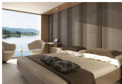
Cabin Category 2

The English-speaking, international crew provides warm hospitality. The M.S. AMADEUS SILVER III meets the highest safety standards and is part of the AMADEUS RIVER FLEET, the only European river fleet to have been awarded the "Green Certificate" of environmental preservation.