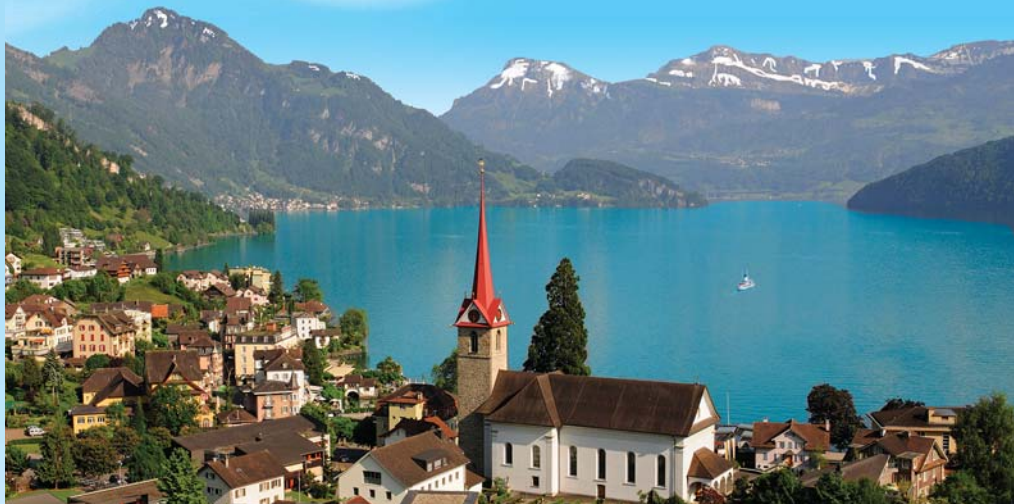
Cruise beautiful Lake Lucerne and enjoy picturesque views of its fjord-like landscape, Mounts Pilatus and Rigi in the distance and its four surrounding cantons of Lucerne, Schwyz, Unterwalden and Uri.

Then, enjoy a scenic transfer to the Alpine resort of Zermatt, located beneath the dramatic pinnacle of the iconic Matterhorn. Check into the chalet-style HOTEL ALEX. This evening, dine in the hotel's handsome, traditional Swiss restaurant.