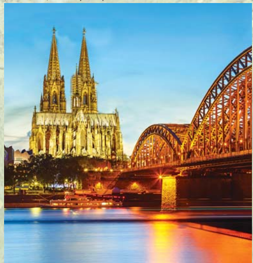
Towering spires crown Cologne's majestic Kölner Dom (cathedral), one of the finest Gothic structures ever built.

Following breakfast, transfer to Zurich for your return flight to the U.S.