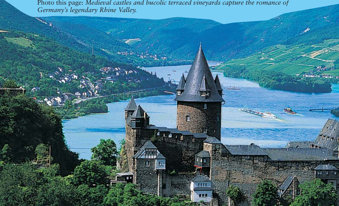
Photo this page: Medieval castles and bucolic terraced vineyards capture the romance of Germany's legendary Rhine Valley.

Cover photo: View the unforgettable peaks of the iconic Matterhorn from the top of the highest cog railway in Europe, the world-renowned Gornergrat Bahn.