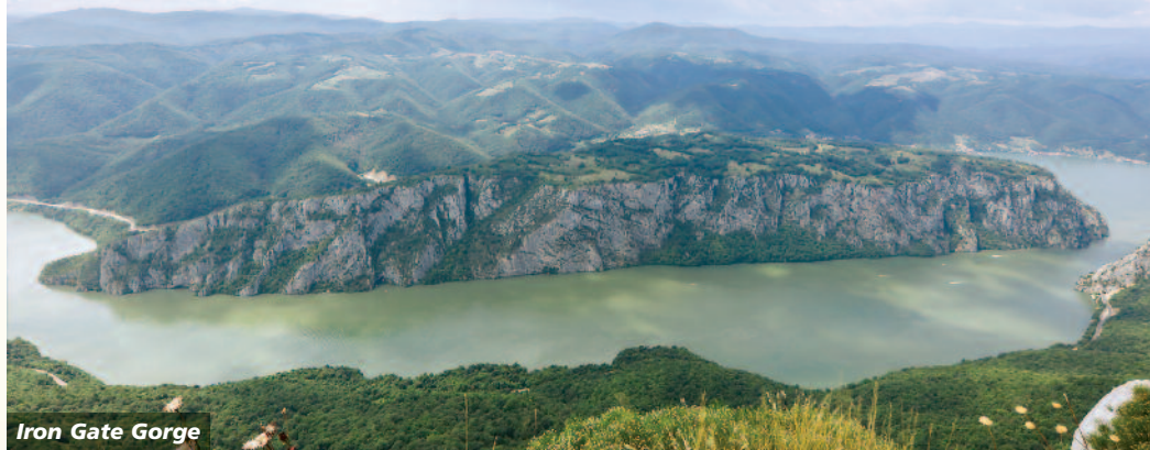
Iron Gate Gorge

architecture and culture. Marvel at the ornate Orthodox cathedral and step into St. Sava, a shining feature of Belgrade's cityscape.