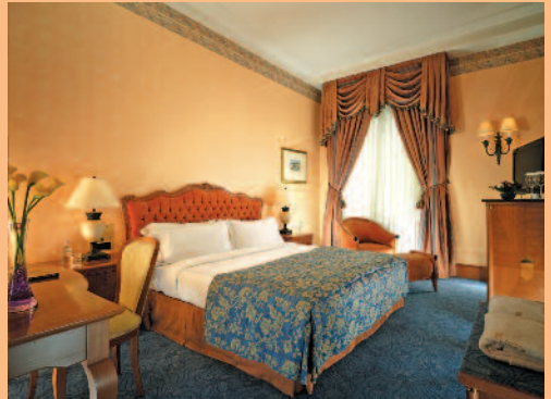
SHERATON SOFIA HOTEL BALKAN SOFIA

Built in the early 1900s, the elegant Art Deco Imperial Hotel is listed on Prague's register of historic buildings. With an art deco façade and a curvilinear art nouveau interior, the hotel is one of the city's architectural gems. It sits in the heart of historic Prague near restaurants, shops and historic attractions. A spa, fitness center and Complimentary Wi-Fi are among the hotel's many amenities, and the Café Imperial is considered to be one of the most beautiful restaurants in the city.