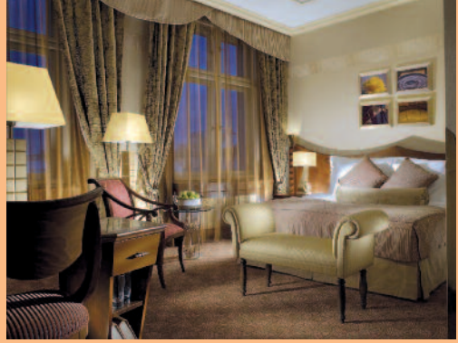
ART DECO IMPERIAL HOTEL PRAGUE

Built in the early 1900s, the elegant Art Deco Imperial Hotel is listed on Prague's register of historic buildings. With an art deco façade and a curvilinear art nouveau interior, the hotel is one of the city's architectural gems. It sits in the heart of historic Prague near restaurants, shops and historic attractions. A spa, fitness center and Complimentary Wi-Fi are among the hotel's many amenities, and the Café Imperial is considered to be one of the most beautiful restaurants in the city.