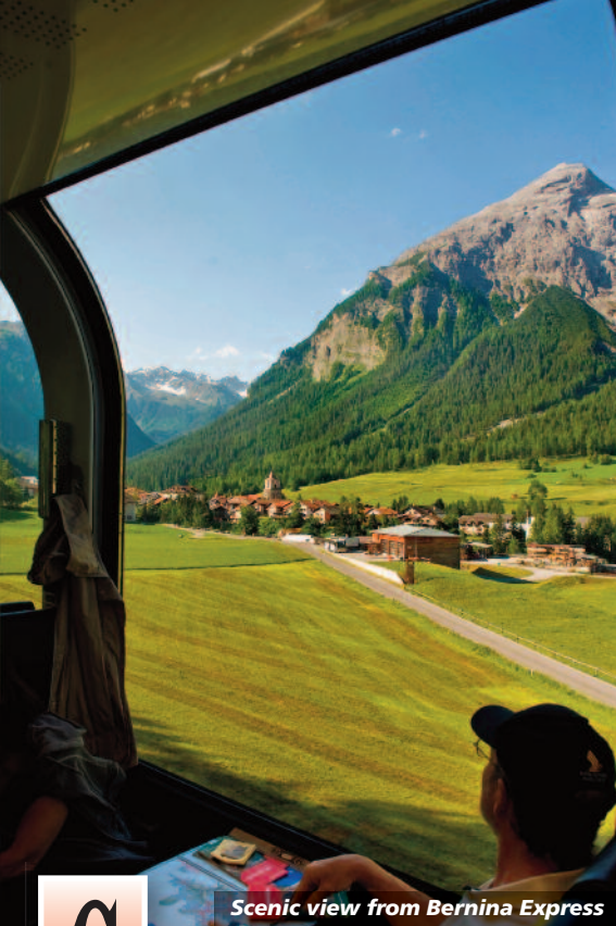
Scenic view from Bernina Express

C ome discover the timeless magic of alpine vistas and glacial lakes. Literary luminaries of the 19th century heralded the idyllic treasures of Switzerland in praise-filled travelogues. Since then, not much has changed in this pristine part of Europe, where magnificent landscapes carved by ancient glaciers continue to thrill visitors. St. Moritz built a glitzy reputation in the 20th century, but this picturesque town first became a popular destination during the Middle Ages because of its therapeutic spring water, which you can still try today. Your journey continues west to Villars, your gateway to towns on the French and Swiss shores of Lake Geneva and impressive mountain landscapes.