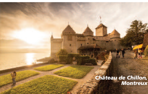
Château de Chillon, Montreux

C ome discover the timeless magic of alpine vistas and glacial lakes. Literary luminaries of the 19th century heralded the idyllic treasures of Switzerland in praise-filled travelogues. Since then, not much has changed in this pristine part of Europe, where magnificent landscapes carved by ancient glaciers continue to thrill visitors. St. Moritz built a glitzy reputation in the 20th century, but this picturesque town first became a popular destination during the Middle Ages because of its therapeutic spring water, which you can still try today. Your journey continues west to Villars, your gateway to towns on the French and Swiss shores of Lake Geneva and impressive mountain landscapes.