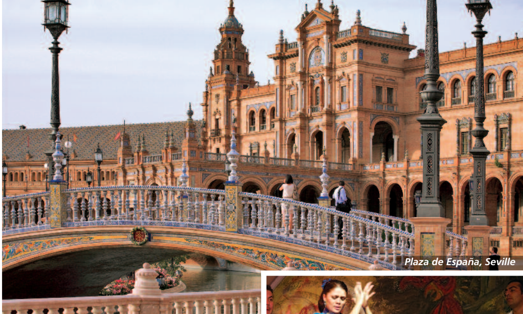
Plaza de España, Seville