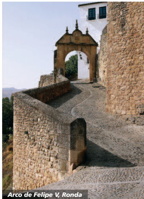
Arco de Felipe V, Ronda

Our personalized air program allows you to select your flights, routing, class of service and dates of travel in consultation with one of our experienced Passenger Service Representatives. Airfares will vary, depending on airline, routing and class of service. In most cases, transfers between the airport and hotel/cruise ship will be included on arrival and departure days. Your Passenger Service Representative will provide you with all of the details you need to guarantee your transfer. Book your air with us to ensure assistance in the case of schedule changes or delays that may impact your air travel plans. AHI FlexAir participants automatically receive flight insurance worth up to $250,000, subject to policy terms.