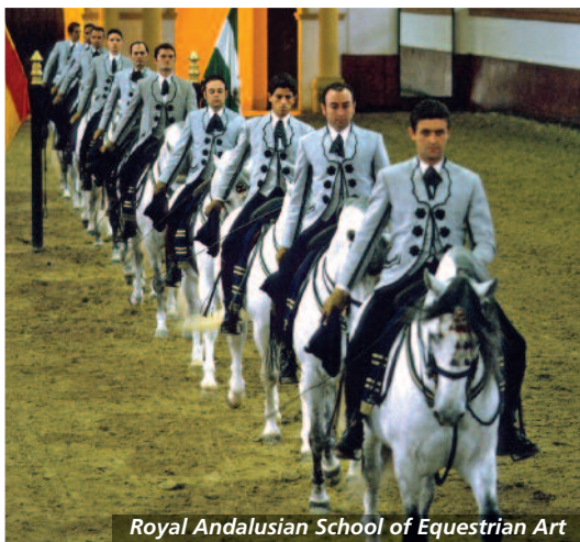
Royal Andalusian School of Equestrian Art

Local Flavor: Enjoy dinner at the Parador de Ronda's restaurant.