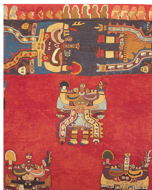
Traditional Peruvian fabric

the Floating Island of Los Uros, where the top-hatted Uros people live on “islands” made of the reeds that grow in the lake’s shallows; in fact, the Uros rely on these reeds for their boats, the small huts in which they live, household items, and the handcrafts they sell to visitors. We also visit Isla Taquile, known for the high quality textiles crafted by the indigenous people who live here; sales of their textiles support the self-sustaining Taquilenos. On our visit, we see the men in their signature woven woolen caps with floppy earpieces, and women in tailored waistcoats and multi-layered