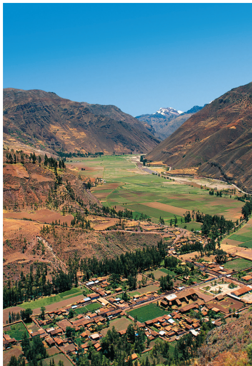
The beautiful and historic Sacred Valley

Day 11: Arrive U.S. We arrive in the U.S. this morning and connect with our flight home.