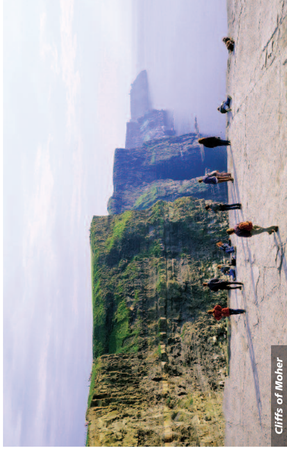
Cliffs of Moher