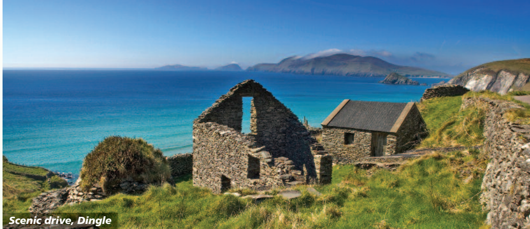
Scenic drive, Dingle