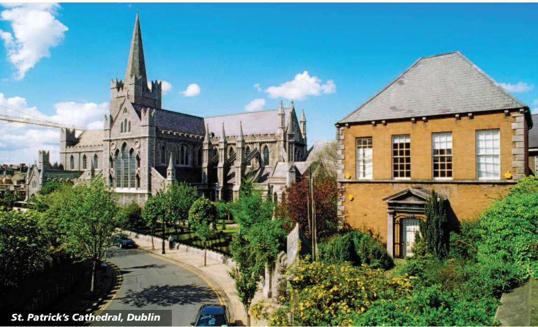
St. Patrick's Cathedral, Dublin