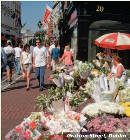
Grafton Street, Dublin

Excursion: Dublin. Dublin is a vibrant city where sandy beaches, rocky coastlines, lush gardens and timeless architecture meet. Visit historic Trinity College and see the famous hand-illuminated Book of Kells, which dates from the eighth century. Explore St. Patrick's Cathedral, named for Ireland's patron saint,