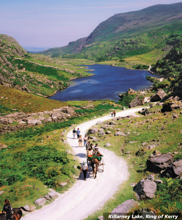
Killarney Lake, Ring of Kerry