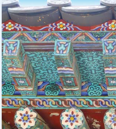
Gyeongju's Buddhist Bulguksa Temple is an important monument to seven of Korea's National Treasures, including

Founded in 780 by the Hosso sect—one of the oldest schools of Japanese Buddhism—this elegant structure, built without a single nail on a wooded hillside above the Otowa Falls, is known for its spectacular views of surrounding Kyoto.