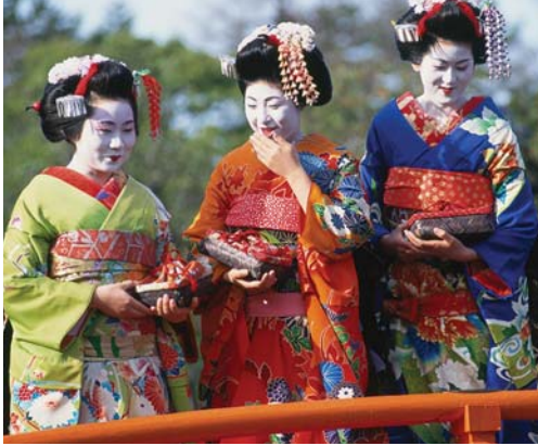
Geishas are easily recognized by their colorfully decorated kimonos and traditional white makeup.