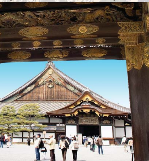
Decorated karamon gate to enter Nijō Castle, one of 17 historic sites designated by UNESCO as a World Heritage site.

Visit Gyeongju National Museum, which houses priceless archaeological and historical artifacts. Enjoy a specially arranged Korean lunch in a local restaurant featuring the regional specialty, galbi gui .