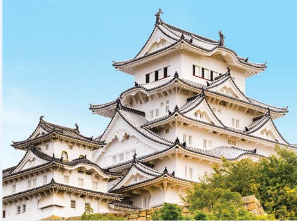
Himeji Castle, a UNESCO World Heritage site, is remarkable as an original wooden structure that has been well-preserved for over 400 years.