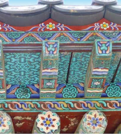
Important example of Silla architecture, and is home to the Seokgatap and Dabotap stone pagodas.