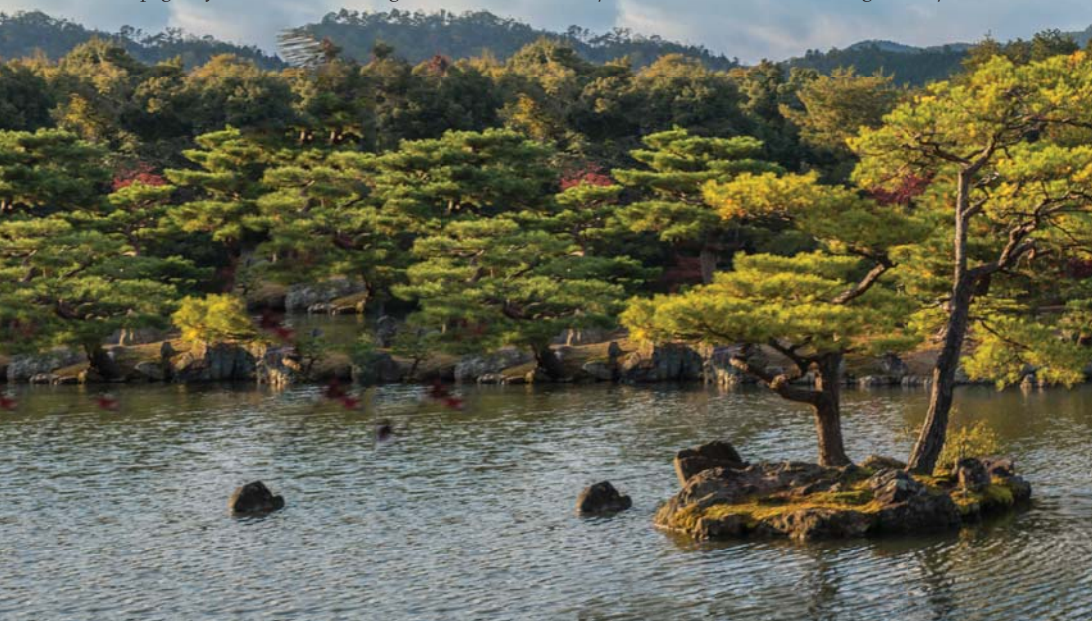
Photo this page: Kyoto’s UNESCO-designated Golden Pavilion functions as a shāriden, housing relics of the Buddha.

Cover Photo: Miyajima’s Great Torii Gate is thought to be the boundary between the spirit and the human worlds.