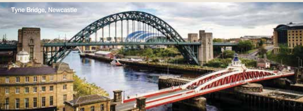
Tyne Bridge, Newcastle

All stateroom/suite locations and prices are subject to availability. Deposit and cancellation policies for categories OS and VS differ from those listed in this brochure. Please call for details.