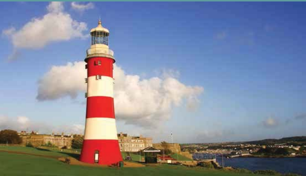
Smeaton's Tower, Plymouth