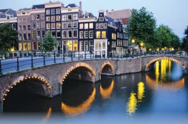
Located in the heart of the capital city, Keizersgracht is the widest canal in Amsterdam.

Amsterdam Pre-Cruise Option The historic heart of Amsterdam, lined with