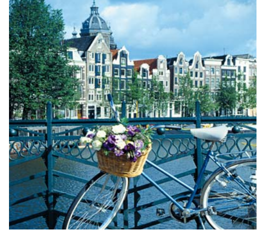
Amsterdam's charming bridges and picturesque canals bring the intimacy of a small town to one of Europe's most celebrated cities.