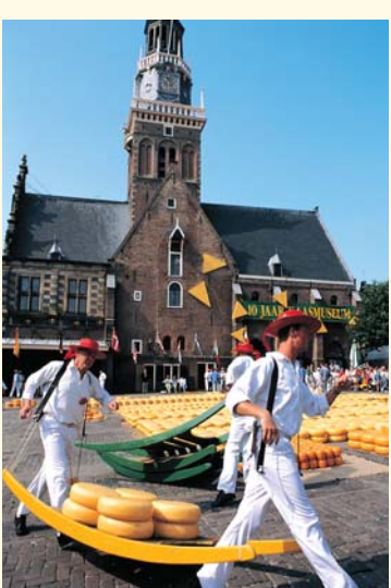
In a traditional Dutch cheese market, cheese porters move sleds of Gouda cheese, named after the city in The Netherlands and one of the oldest cheeses still made today.