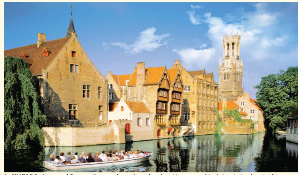
In UNESCO-designated Bruges, discover the city's medieval architecture and look for the landmark 13th-century belfry, which houses a 47-bell carillon and employs a full-time carillonneur to play it.