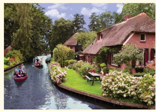
The quaint, picturesque town of Giethoorn boasts over four miles of canals and no traditional roads.

The timeless, fairytale city of Bruges is a UNESCO World Heritage site of treasured architecture, virtually untouched since the 15th century and one of the best-preserved medieval cities in Europe. It is built around a double ring of picturesque canals connected by charming arched foot bridges and is world-renowned for its delectable, hand-crafted chocolates. Enjoy a walking tour from the Market Square to the extraordinary Gothic Chapel of the Holy Blood, seeing Bruges' magnificent, deftly crafted stone guildhalls and opulent churches dating back to medieval times.