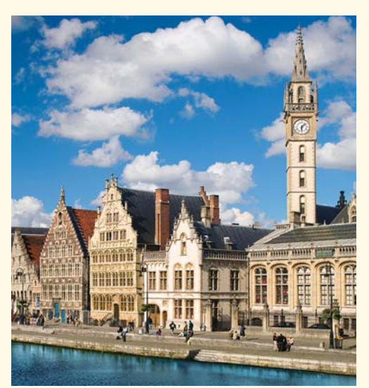
Ghent's medieval harbor, Graslei is known for its beautifully intricate, well-preserved guildhall façades.

known as the "Venice of The Netherlands." No traditional roads can be found in this village; residents and visitors commute by boat, by bicycle or on foot. Board a small boat for a private tour along the village's serene waterways.