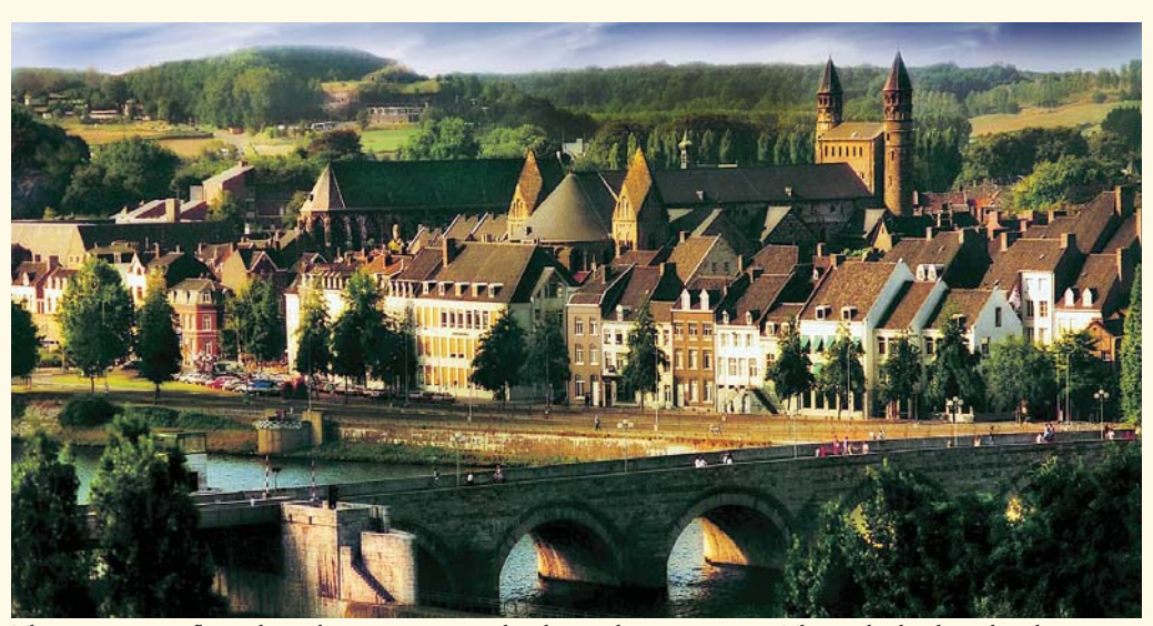
The River Meuse flows through ancient Maastricht, the southernmost city in The Netherlands, rich in history dating back to the Romans in the first century B.C.

With four miles of canals and over 150 bridges, the beautiful town of Giethoorn is affectionately