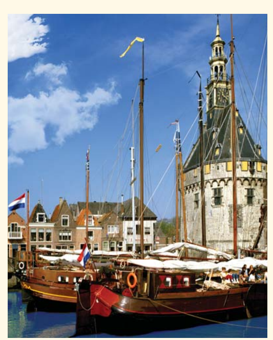
The 16<sup>th</sup>-century Hoofdtoren tower in Hoorn is one of the city's last preserved defenses.

No funds donated to The Association of Former Students or to Texas A&M University have been used in the production or mailing of this travel brochure; all such costs are covered by our tour supplier.