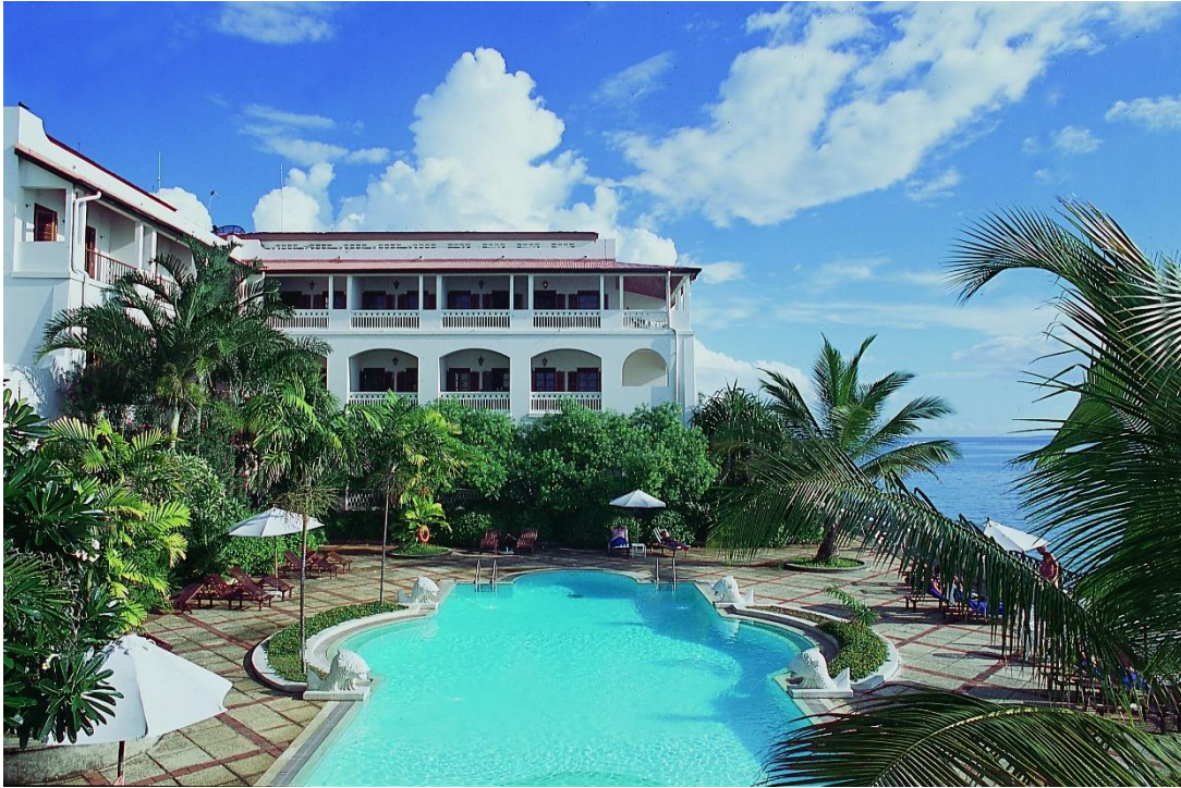
Zanzibar Serena Hotel – Your home on the Indian Ocean