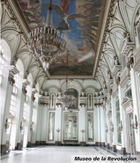
Museo de la Revolución

Check in to the Crowne Plaza Miami International Airport in Miami, Florida.