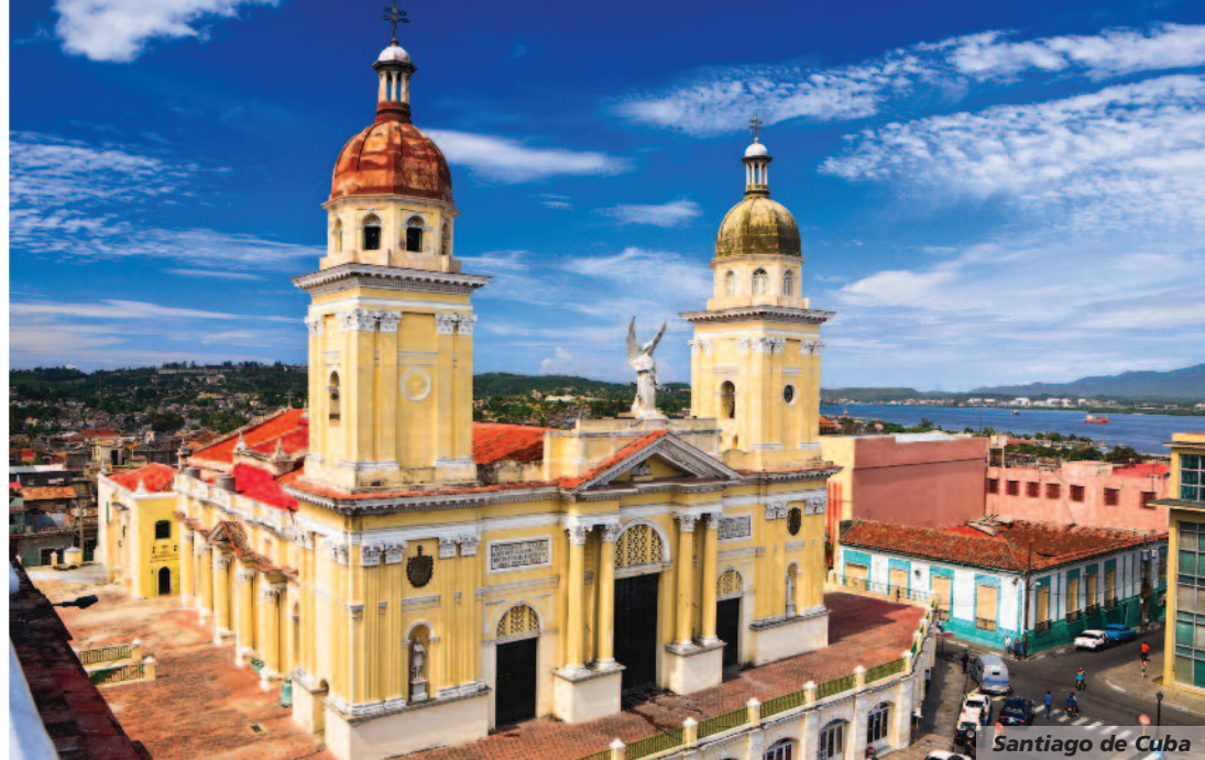
Santiago de Cuba