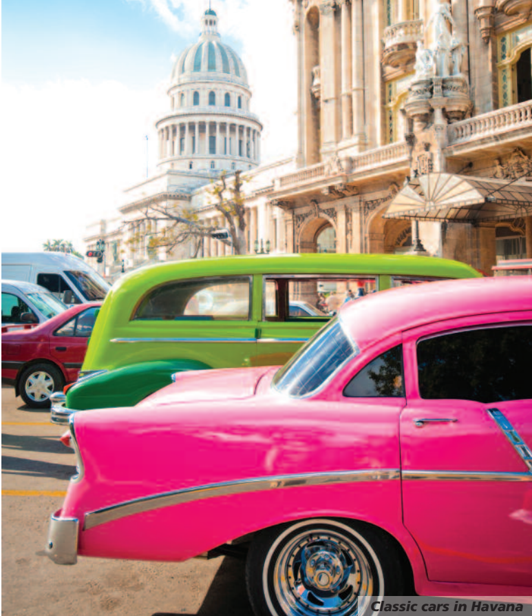
Classic cars in Havana