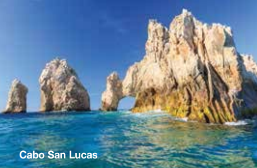
Cabo San Lucas