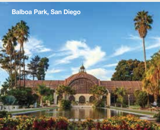
Balboa Park, San Diego

Famed for the colorful bird and national symbol from which it takes its name, Puerto Quetzal is Guatemala’s largest Pacific Ocean port and a gateway to some of the country’s most resplendent scenery. Beyond the town lies lovely Antigua, the country’s old colonial capital, cradled by towering volcanoes and sprinkled with peaceful tree-lined plazas and exquisite Spanish colonial architecture.