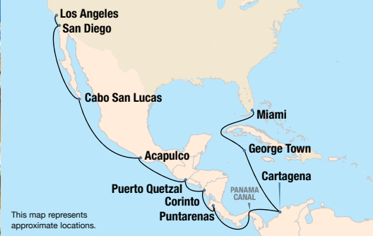
This map represents approximate locations.