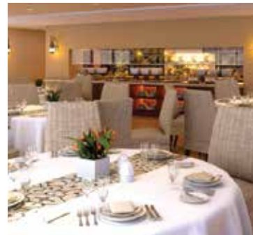
(L to R): Amazon Discovery; Observation Deck; Flora Suite; Dining Room; Machu Picchu