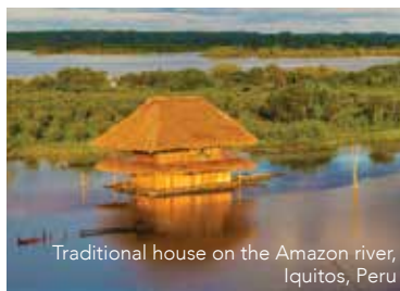
Traditional house on the Amazon river, Iquitos, Peru

Singles are available in the Flora Suite for $7,095 and the Fauna Suite for $6,395 if booked on or before August 4, 2015. * Savings price applies only to reservations made and paid in full by November 16, 2015.