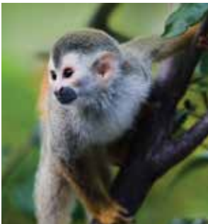
Giant lily pads; Squirrel monkey