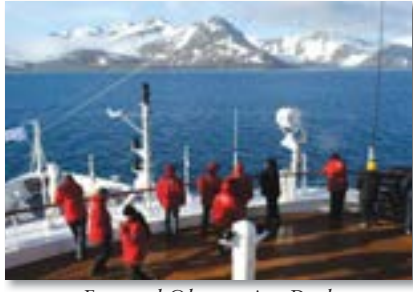
Forward Observation Deck

*Limited to only 90 Suites and Staterooms on this expedition.