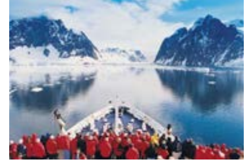
Stand on the bow of the M.S. LE LYRIAL and watch Antarctica's drama unfold before you.