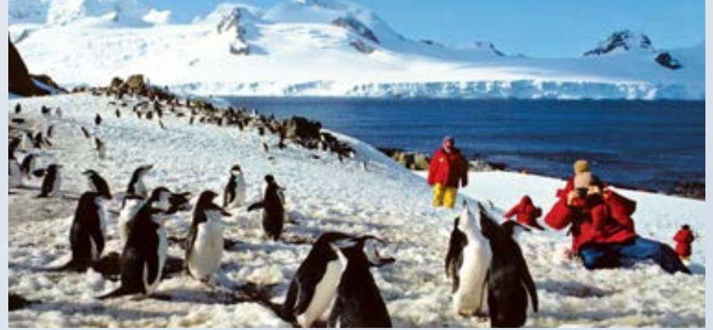
A visit to Antarctica offers an unparalleled opportunity to get an up-close view of chinstrap penguins in their natural habitat.

Gain insight into the lives of past explorers at the British Antarctic Survey Museum and mail a postcard stamped with an Antarctica postmark from the official British Post Office. Later, cruise through breathtaking, glacier-lined