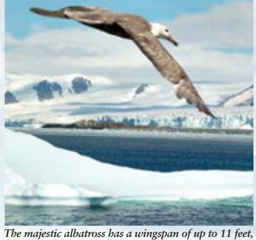
The majestic albatross has a wingspan of up to 11 feet, enabling it to fly for hundreds of miles at a time.

To protect the fragile Antarctic environment, all travelers will go ashore in small groups, so as not to over visit rookeries, disturb nesting sites or disrupt research. All visitors will be asked to take and leave—nothing ashore.