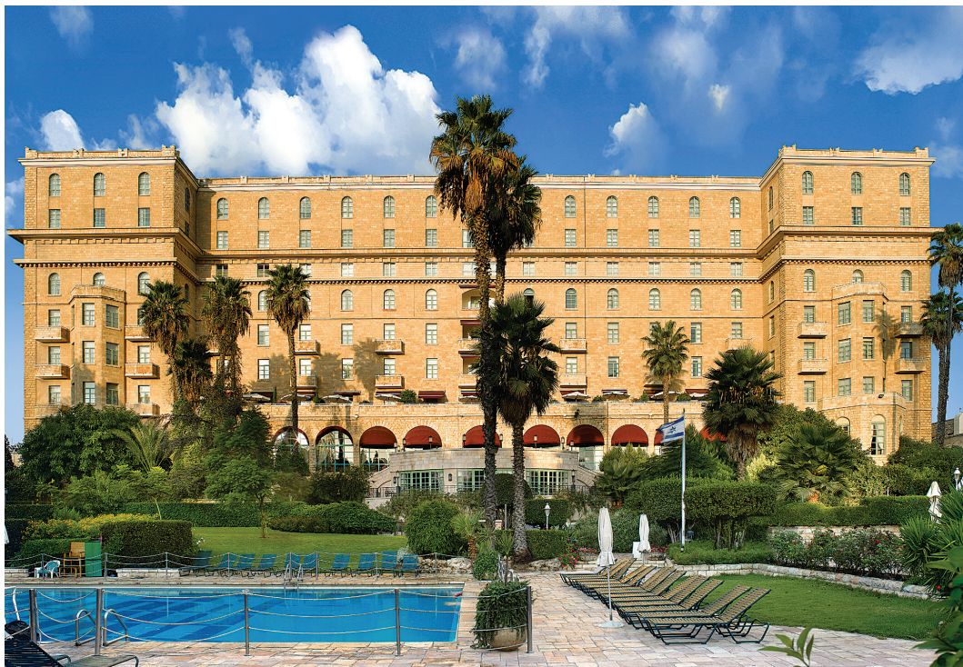
Enjoy a five-night stay at the legendary King David Hotel in Jerusalem.

ancient city has attracted visitors, settlers, and invaders for more than two millennia. B,D