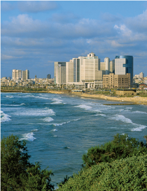
Sophisticated seaside Tel Aviv

Day 10: Jerusalem/Old City We return to the Old City today, starting at the original settlement of the City of David, dating to at least the Middle Bronze Age of 1800 to 1550 BCE. An archaeologist gives us an in-depth account of Jerusalem’s role throughout history before we embark on a walking tour through the Old City: the Jewish Quarter; the ancient Cardo marketplace still in use today; and the Western Wall, sacred to Jews as the last remaining trace of the wall that enclosed and supported the Second Temple on the Temple Mount. Tonight we dine at a local restaurant. B,L,D