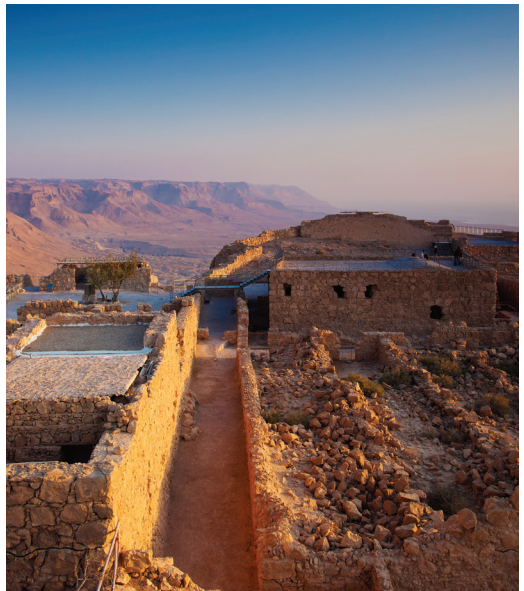
The ruins of Masada

Day 11: Jerusalem/Masada/Dead Sea Today we travel to the shores of the Dead Sea to explore the Qumran Caves, where the Dead Sea Scrolls were