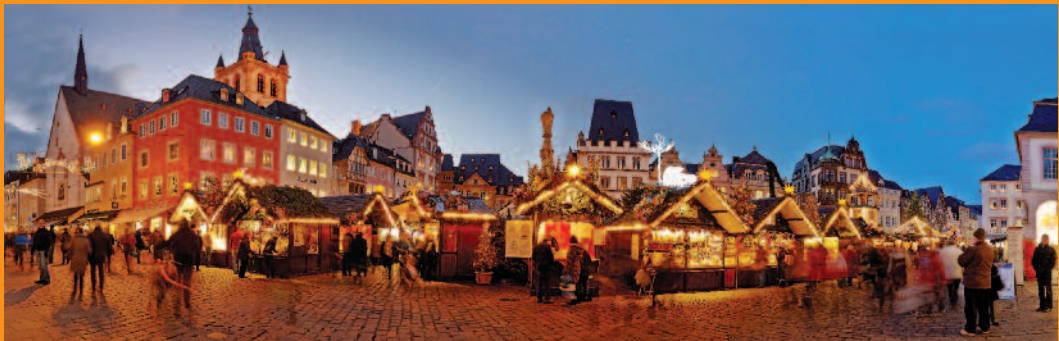
The magical atmosphere of the holiday market in Trier

† Provided only for AHI FlexAir passengers.