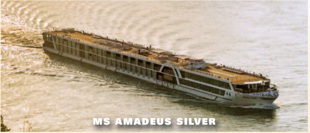
MS AMADEUS SILVER

The state-of-the-art MS Amadeus Silver debuted in 2013 as a flagship of the innovative Lüftner cruise line. This stylish ship offers the utmost in service, safety and comfort. Step into the elegant reception area and immerse yourself in the ambience of a high-end hotel. Relax on the sun deck, indulge in a soothing massage, browse in the boutique or connect with friends at the Internet station. If you wish to be more active, practice your golf game on the putting green or exercise in the fitness room. Savor international cuisine at the restaurant's delicious breakfast and lunch buffets, and enjoy regional specialties at dinner. At the end of each day, return to the comforts of your cabin, appointed in bright, modern décor and featuring a river view, a satellite TV and a private bathroom with shower.