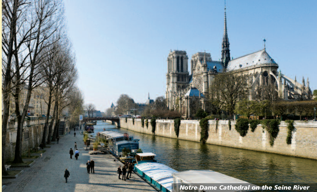
Notre Dame Cathedral on the Seine River