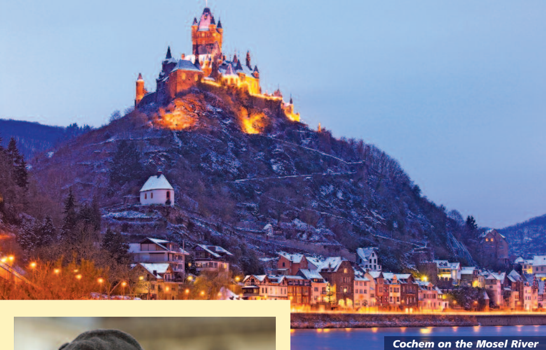
Cochem on the Mosel River