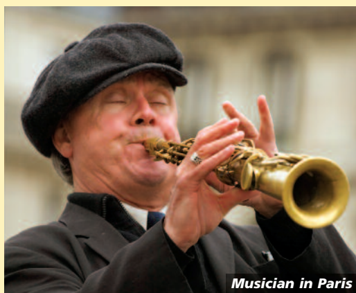
Musician in Paris